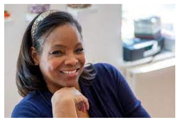
Founder & Chief Patient Advocate Karen's Club

October is Breast Cancer Awareness Month, and for the world it is a reminder to remember those we've lost to this deadly disease and more importantly what can we do as a community to become aware, educated and take steps to protect our health.