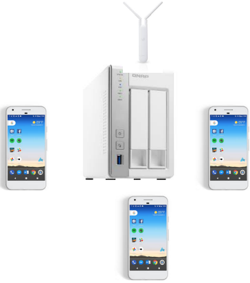
Community Health Centre A

wifi network can easily be extended around any health centre, see Moroto Architecture