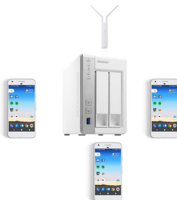
Community Health Centre B