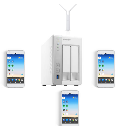
Community Health Centre C

Wifi is economical to build out in a region and with high speed communications, central specialists can now video with patients if the CE worker cannot diagnose the problem.