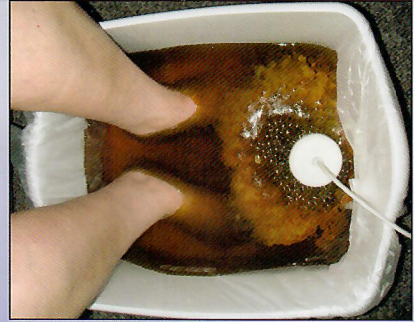
After 10 Minutes