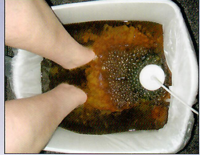
After 20 Minutes