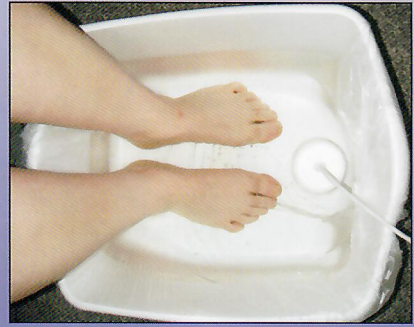
Before Foot Bath