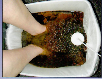
After 30 Minutes