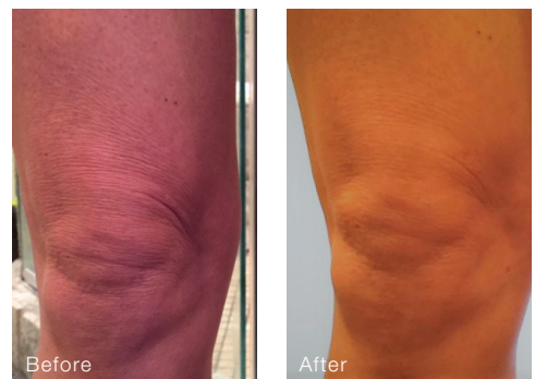
SKIN LAXITY | TEXTURE

Results after 4 weeks, using Body Lift once daily