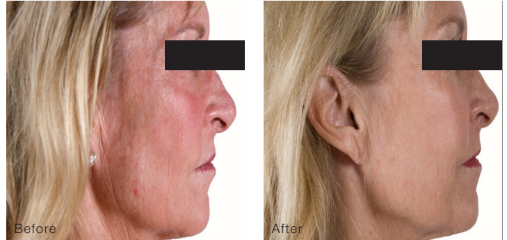
PIGMENTATION | TEXTURE | LINES

Results after 24 days, using Stem Cell Therapy Serum & Accelerator 2x daily