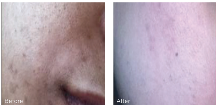
ACNE | HYPERPIGMENTATION

Results after a combination of 2 Venus Viva treatments while using Stem Cell Therapy Serum & Accelerator 2x daily, over 8 weeks