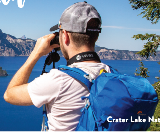
Crater Lake National Park

We invite you to come, meet me in Klamath.