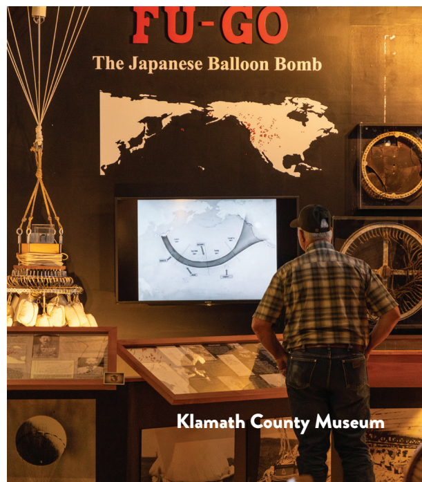
Klamath County Museum