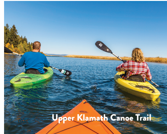
Upper Klamath Canoe Trail