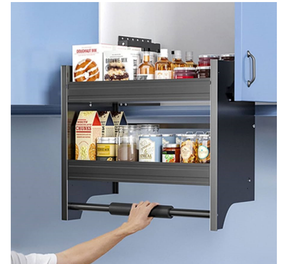
Upper Cabinet Pull-down Shelf