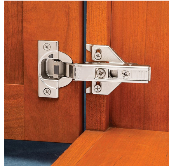
Soft-close Concealed Hinges

Do you want soft-close doors and drawers?