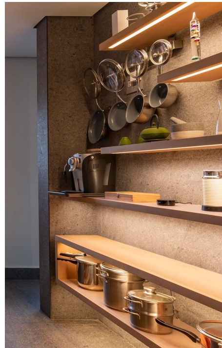
Shelves with Undercabinet Lighting

Any floating shelf outfitted with slim LEDs underneath to illuminate countertops and highlight décor.