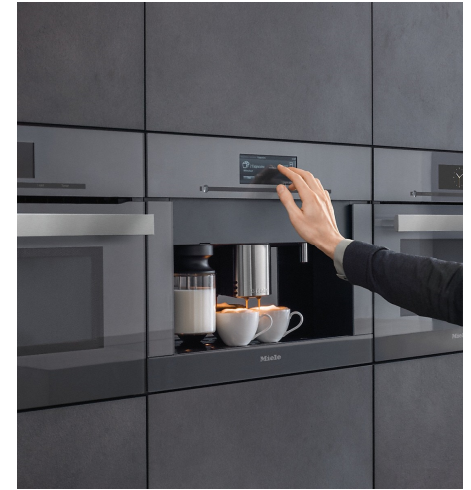
Built-In Espresso Machine