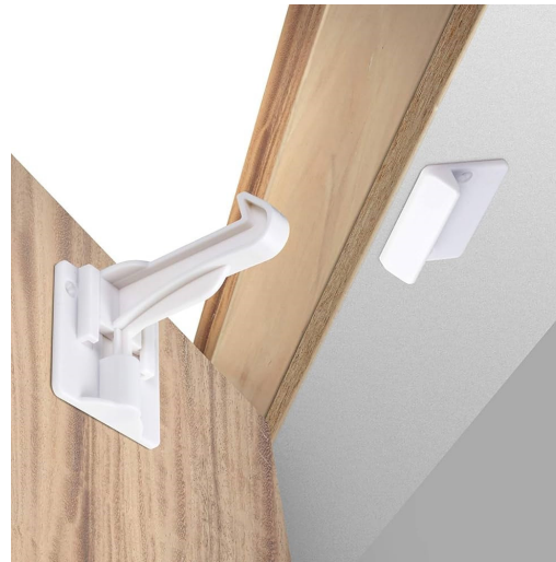
Concealed Baby Proofing Latch Lock