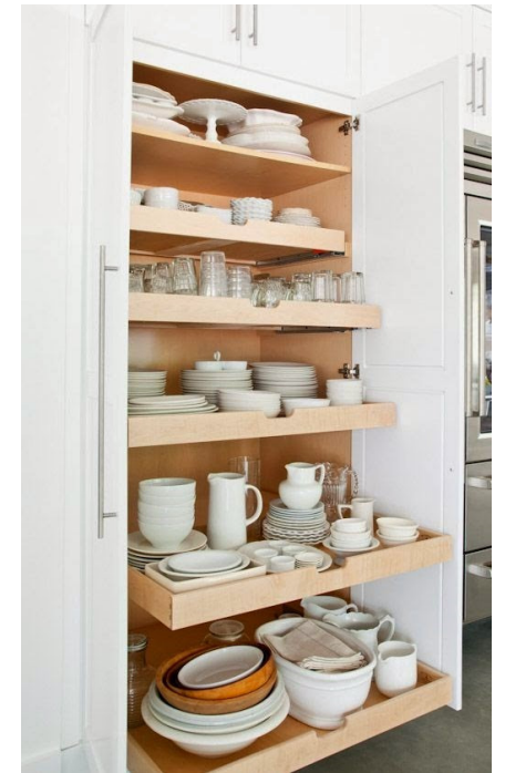
Pantry with Rollouts