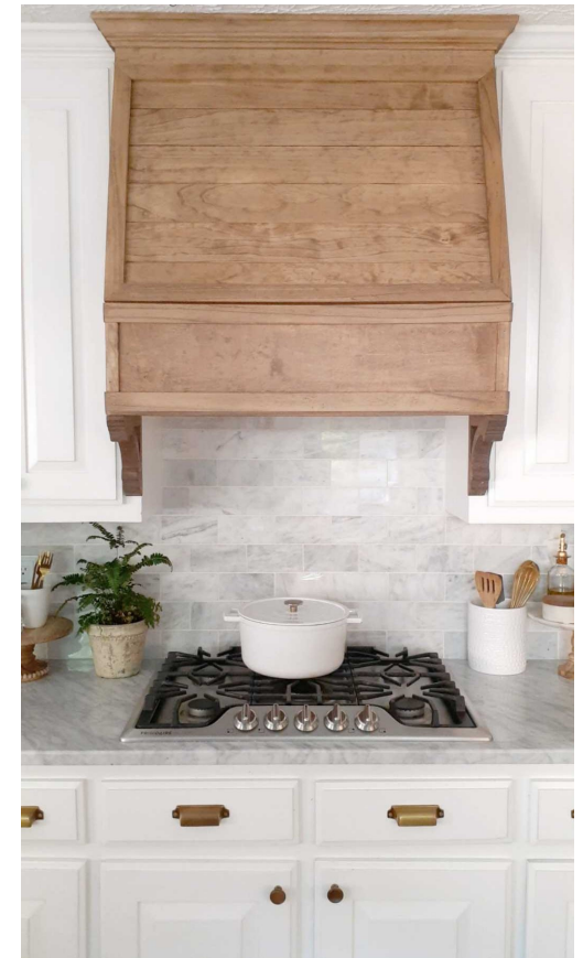
Wood Vent Hood