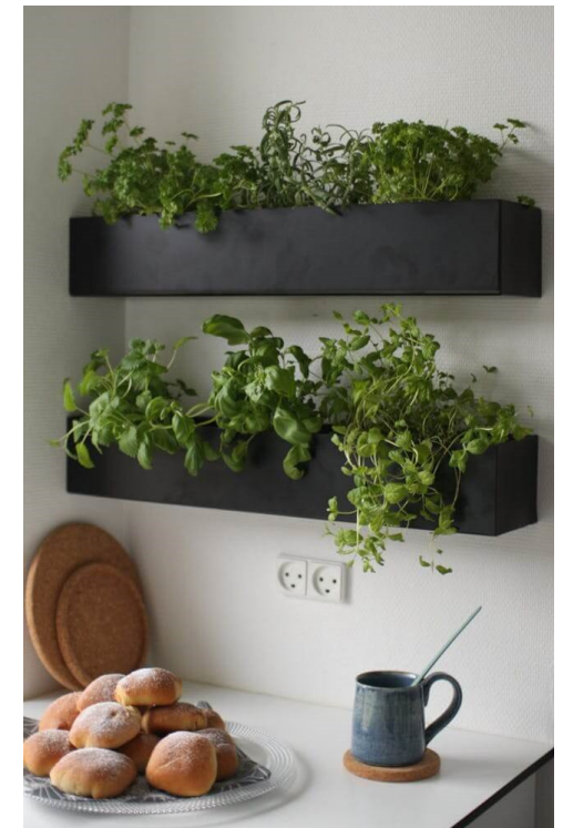
Herb Planter Shelves

Shallow wood shelf with built-in planter trough - grow fresh kitchen herbs right above the backsplash