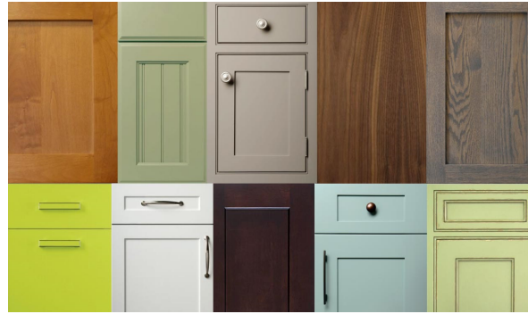
Cabinet Door Styles

Style: (Boxed, curved, tapered, angled) Vent hood insert or blower info?