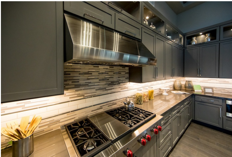
Under Cabinet Lighting