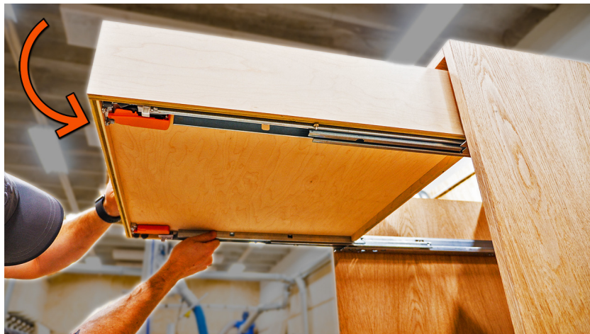
Soft-Close Undermount Drawer Glides