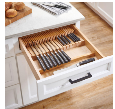
Knife Block Drawer Insert