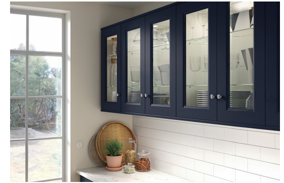
Glass Cabinet Doors