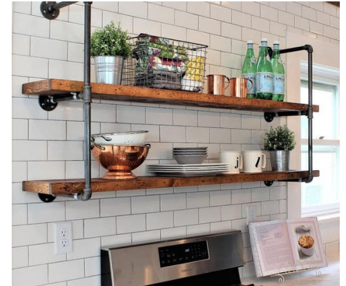
Pipe & Wood Shelves

Reclaimed wood supported by black/brass pipes; double as utensil or mug hangers.