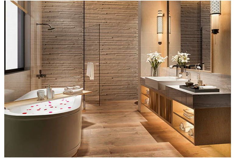
Under Cabinet Lighting for Floating Vanities

Is there anything else you would like to include or emphasize in your design?