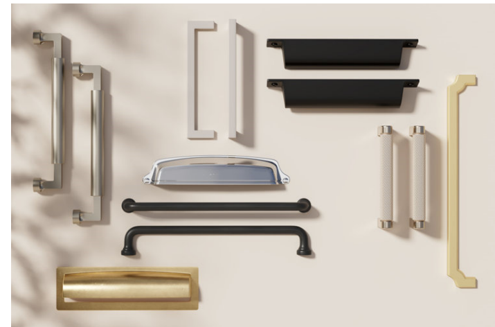
Hardware Pulls & Knobs