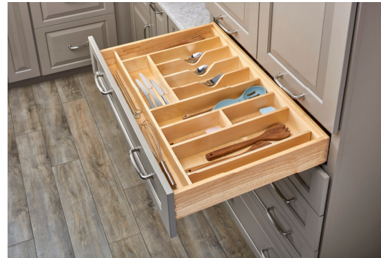
Utensil Drawer Insert

Would you like any roll-out tray dividers (for baking sheets, trays, etc.)?