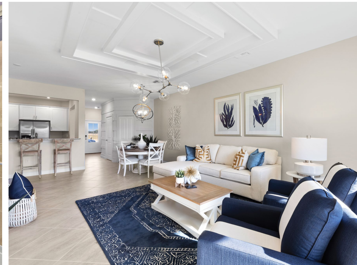
Open-Concept Living Area

1,879 Sq. Ft. Living A/C 29 Sq. Ft. Entry 120 Sq. Ft. Lanai 260 Sq. Ft. Garage 2,288 Sq. Ft. Total