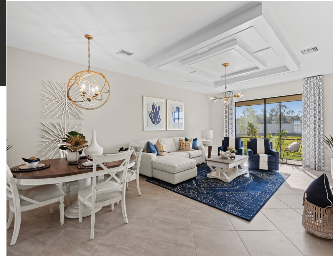
Breakfast Nook & Family Room