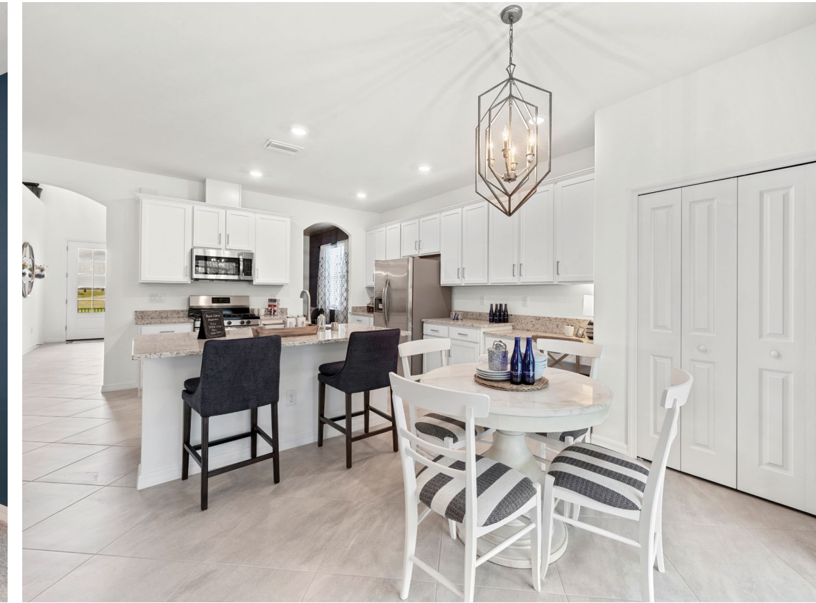
Breakfast Nook & Kitchen