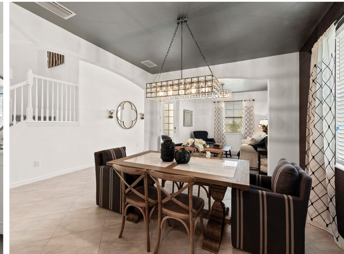
Dining Room & Living Room