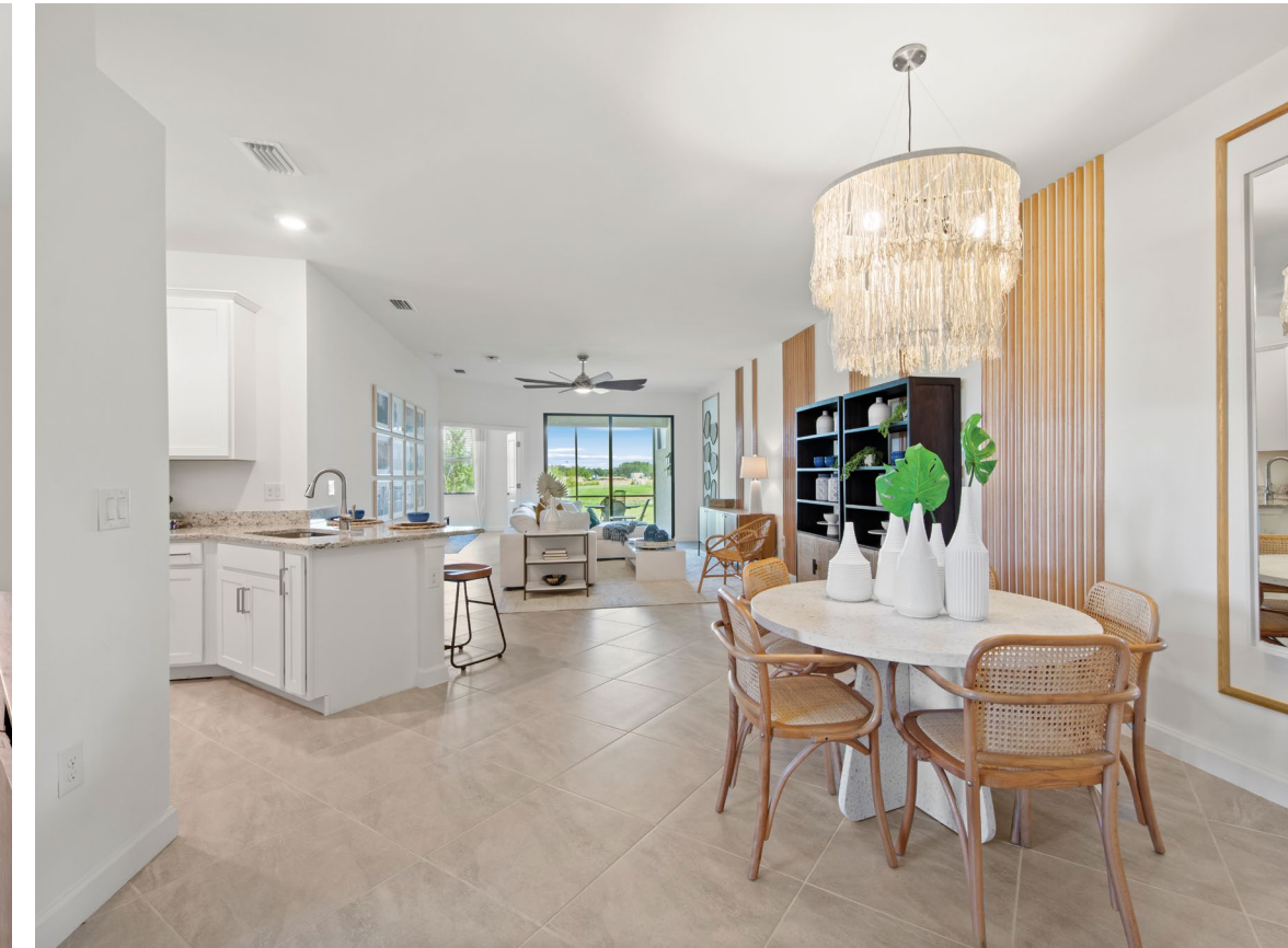
Open-Concept Living Area