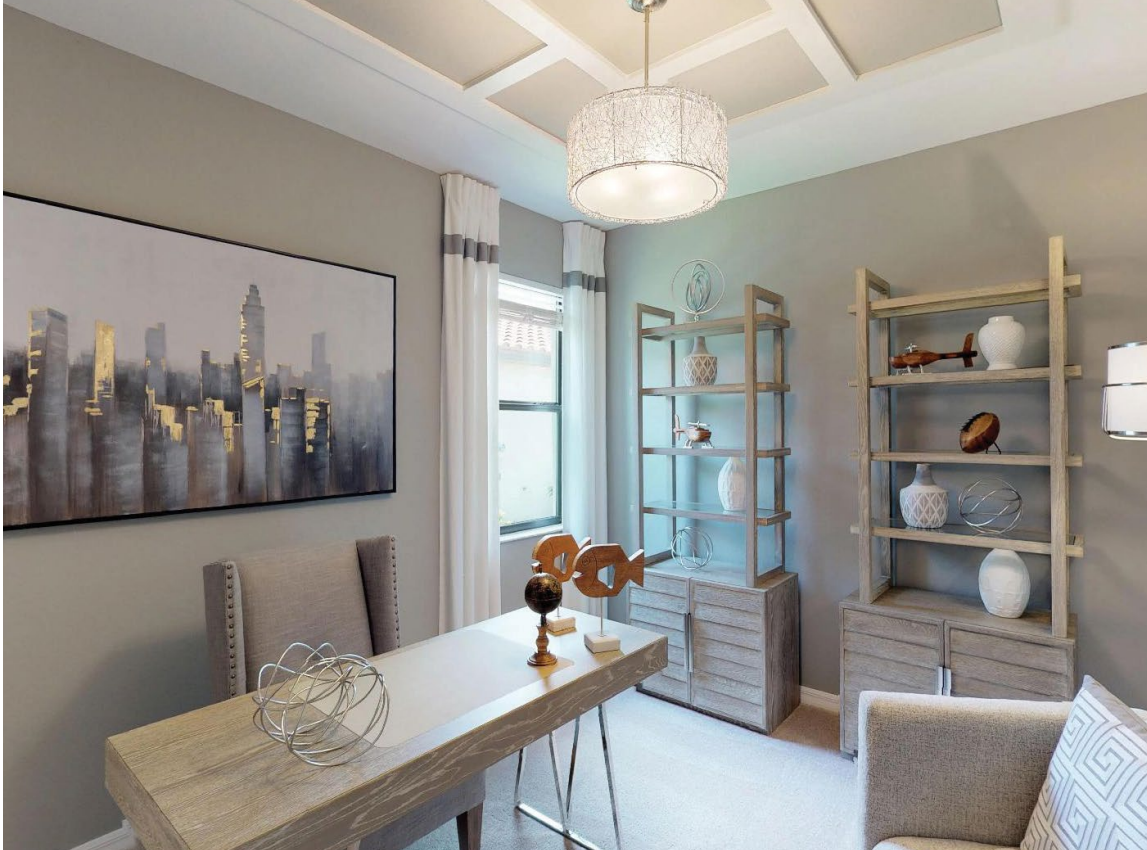
Bedroom Styled as a Den

Princeton II Model Photos - Arborwood Preserve