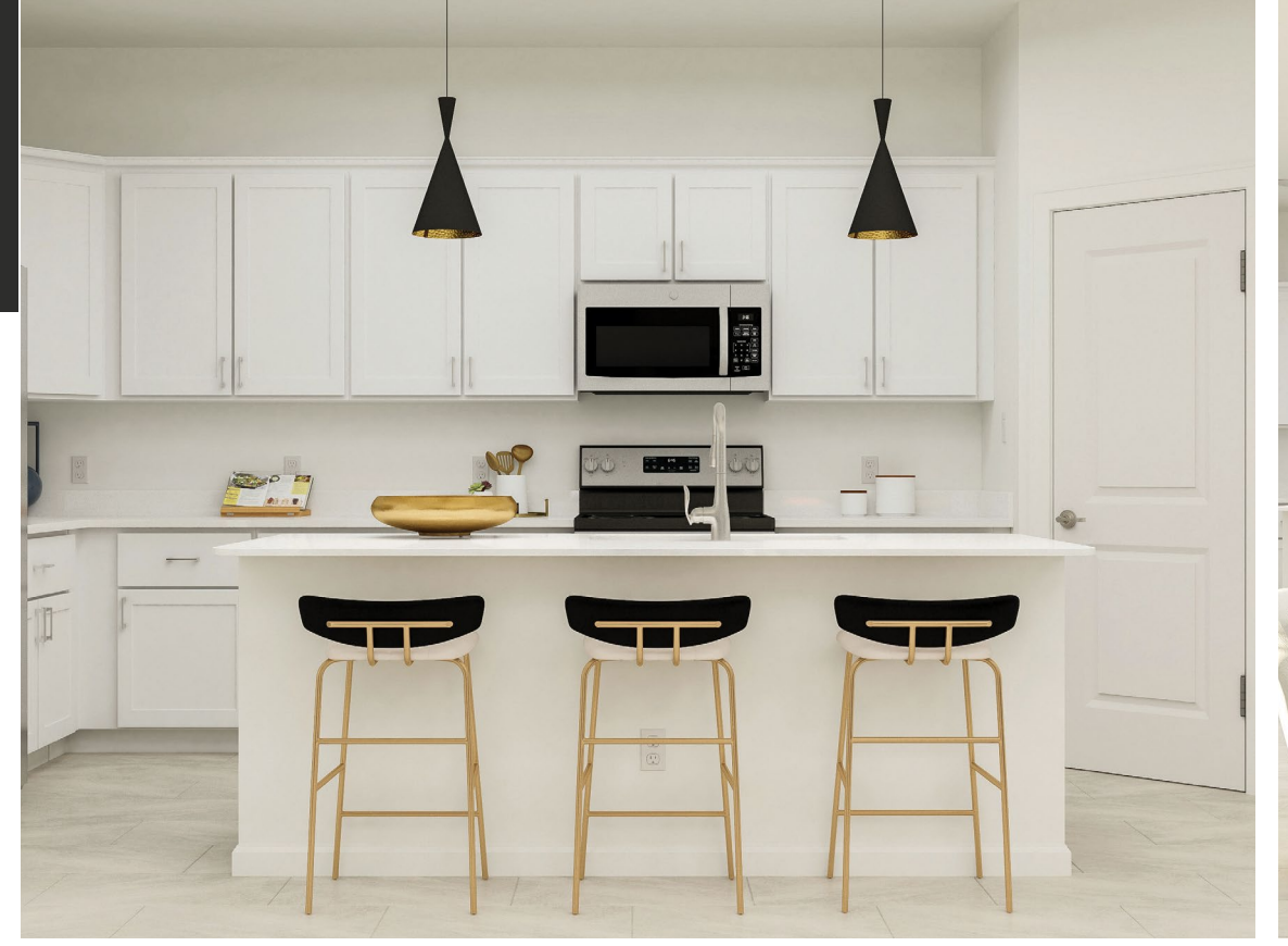
Open-Concept Living Area