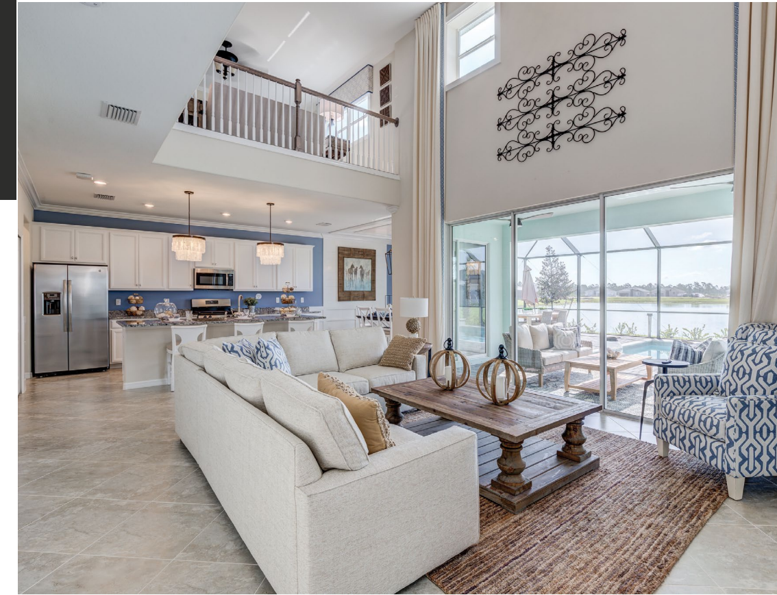
Open-Concept Living Area