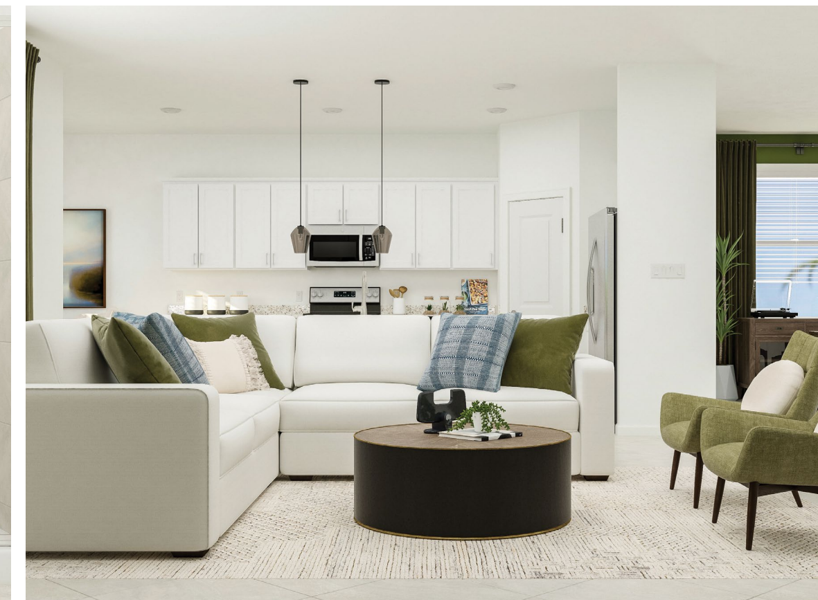
Open-Concept Living Area