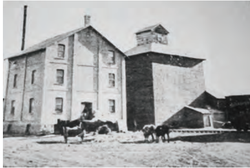
The mill in 1910, above; Repair work in 2018, below.