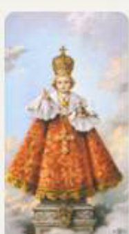
Infant of Prague