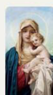
Mother & Child