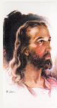
Christ the King