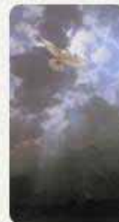
Dove of Peace