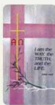
Way, Truth & Life