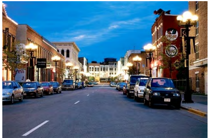
Downtown La Crosse, Wisconsin