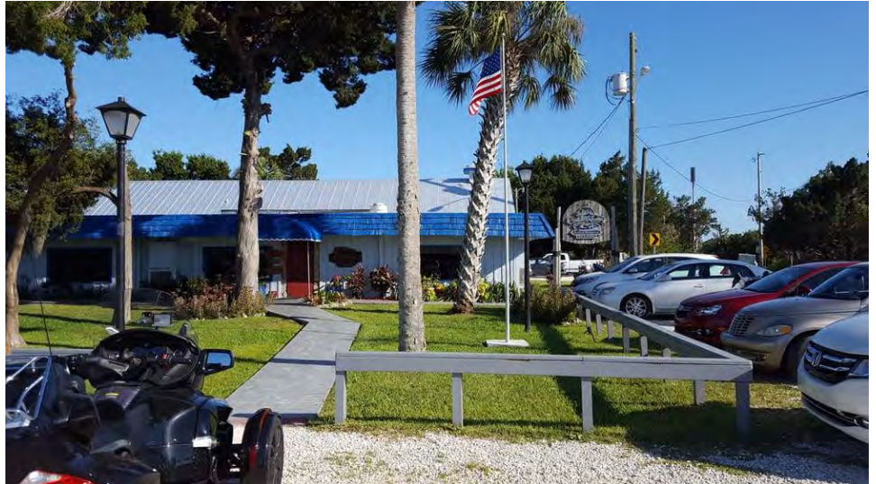
Peck's main entrance (picture from the internet)