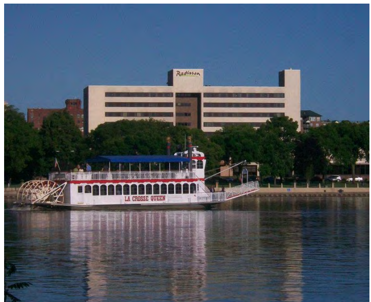
View of Radisson Inn from Mississippi River