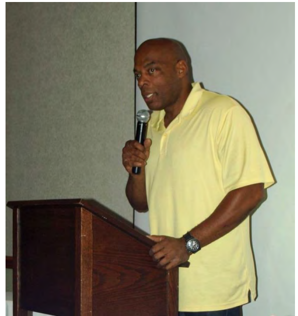
Alonzo Bodden at STAR 2016