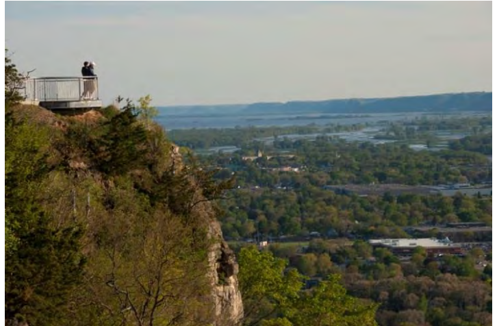
Granddad Bluff near La Crosse