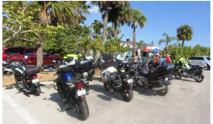
Just a few of the bikes at 12 Buoy

prepared the restaurant crew for 10-15... 8 early arrivers from Okeechobee had warmed them up; we pulled in with 10 bikes; and by the time we had all gathered, 28 hungry riders made our presence known at one end of their outdoor dining area!! Kudos to the staff, as they made us feel most welcome and did a terrific job serving all of our needs!! As the weather couldn't have been any better, hardly anybody noticed how the time flew by!! Most of the attendees chose a long route home as well. A few of us stopped by the Indian Dealership in Stuart to catch the very end of their bike and car show. Quite the showroom, with some truly beautiful rides!!