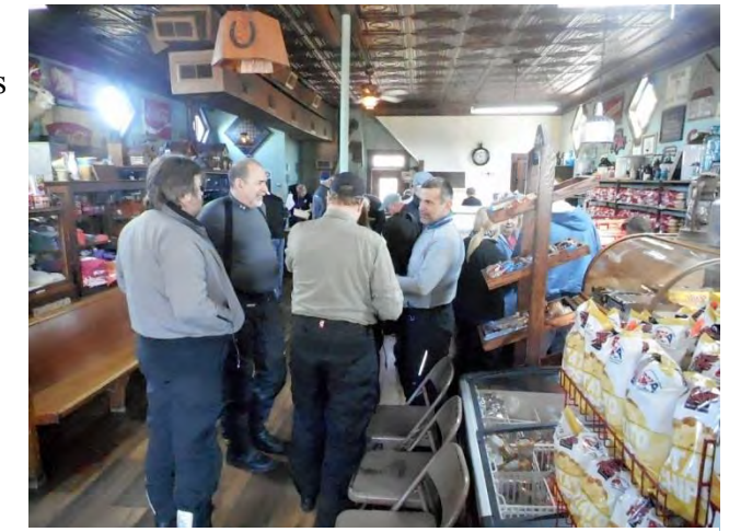
Inside the Moonshine Store

We spent our late morning hours at the Moonshine Store to get a jump on the anticipated next day's crowd. We purchased our obligatory Moonshine tee shirts and sampled their food. After that we took a short ride over to a tractor garage in Casey, Illinois for a fund raising barbeque. A best guess was over 100 riders showed up to enjoy some great BBQ, baked beans and coleslaw.