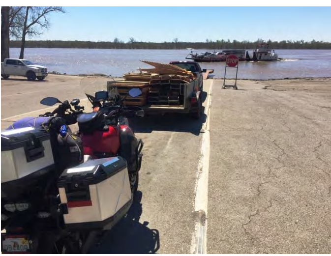
Waiting to take the ferry across the Ohio River.

The Moonshine Lunch Run is a unique experience. It is definitely worth doing at least once if for nothing more than to add to your ride resume. You will meet lots of nice people and enjoy some fantastic Midwest food. Mark your calendar and take the time to experience it. You won't be disappointed.