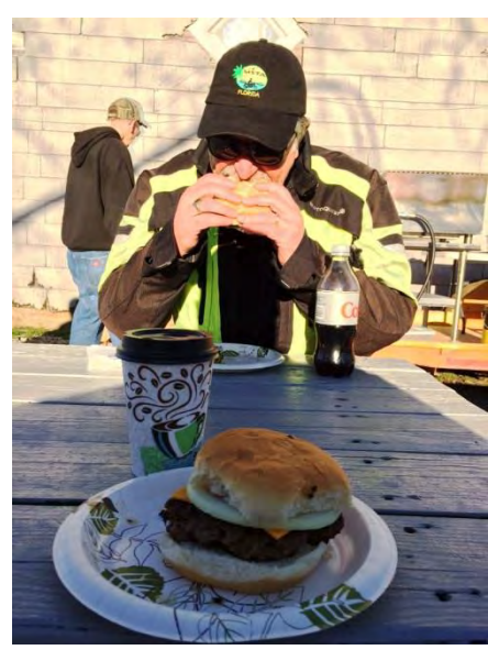
I'm really enjoying that Moonburger!

A couple of hours of socializing and hamburger consumption took place before the really big crowds started to arrive. The folks at Moonshine judge their crowd size each year based upon the number of burgers sold. This year they broke the record by selling 3,362 burgers by day's end!