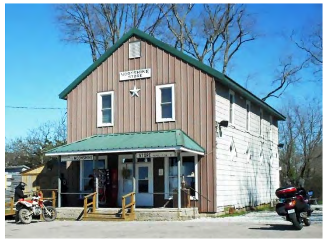
The Moonshine General Store

Each time I have gone it has been a spur of the moment decision. This year the weather forecast called for so-so weather but nothing great. A couple of days before the event a strong cold front was predicted to move rapidly into the entire Midwest region. Knowing this I decided to get an