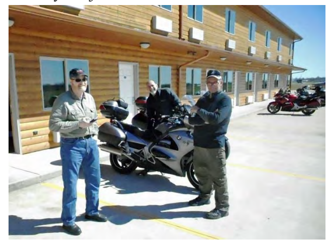
Lincoln Suites in Marshall, Illinois

My destination and accommodations for the next few days was the Lincoln Suites in Marshall, Illinois. I had originally planned on staying in Terre Haute, IN as all hotels close to Moonshine had been booked weeks in advance. However on