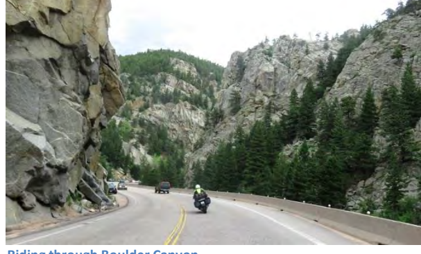
Riding through Boulder Canyon