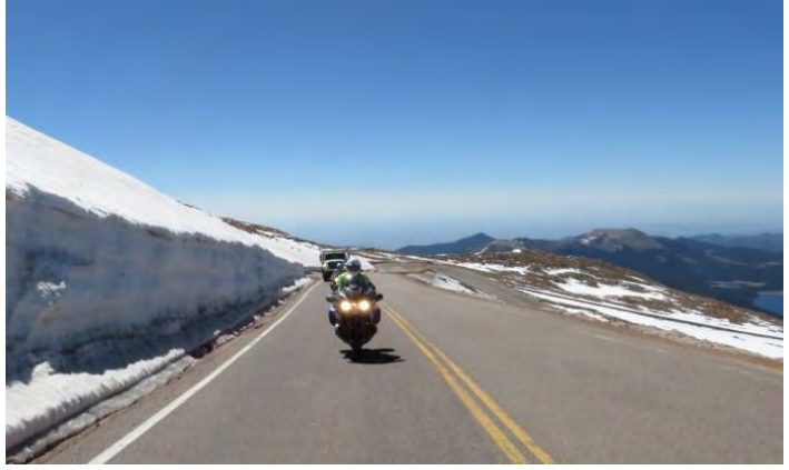
Van on R1200RT heading up Pikes Peak

Alas, I was not ready for 14,100+ feet just yet. Once I made it to the top, I felt the first signs of "mountain sickness" kick in. With many ski trips, and some minor climbing experience, I knew my next move had to be a few thousand feet back down the mountain. I found a pull out with a perfect vista view, and waited for a familiar "face" to come around the corner. Jim Park and I had a blast making our way back to the mountain general store. But only after a nearly disastrous encounter with the bicycle vendors!! Somehow, "they" wangled a deal to take tourists up to the top of Pikes