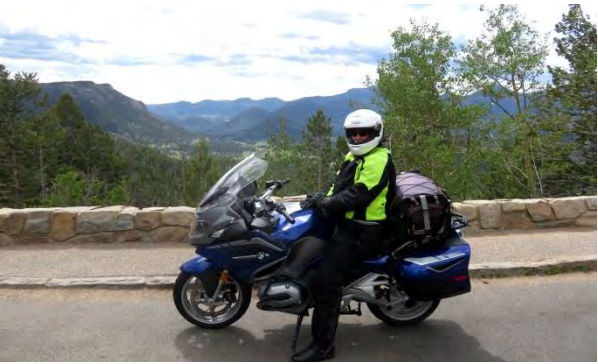
Van on BMW R1200RT in RMNP

Damn... Every good time comes to an end... BUT, not until we have one more day of rip roaring fun!! We have so much crammed into one day; we roll just as the sun breaks cover! We fill up our tanks and bellies for a blast to Rocky Mountain National Park. WOW!! The roads to, through and away from this bit of heaven are just plain stunning!! Miles of curves for hours on end! Mountain vistas, fuzzy antlered elk nibbling grass at the edge of the road, and one more summit conquered!!