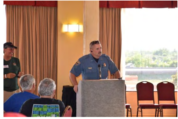
Colorado State Trooper

Sunday is the first day of any STAR, and the Opening Night festivities were highlighted by the wise words of the local CO State Patrol Trooper. That's him in the adjacent photo (868). He was to the point, with lots of advice to having a great time AND to be safe doing it. With lots of humor! He admonished us with this: during his long career, he had never had a rider in ATGATT become DOS/DOA, ever. And, then confessed that he wouldn't recognize any of us out on the roads!! I believe that we all went ticket free for this STAR!!