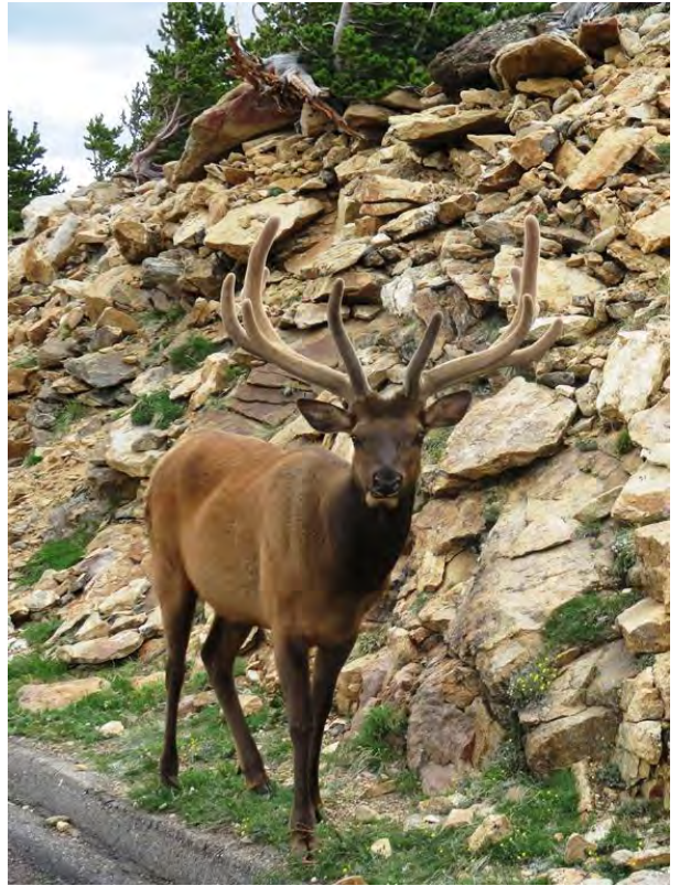
A large Elk alongside Trail Ridge Road

So, let me ask you, have you already started planning for STAR 2018 in Wisconsin??