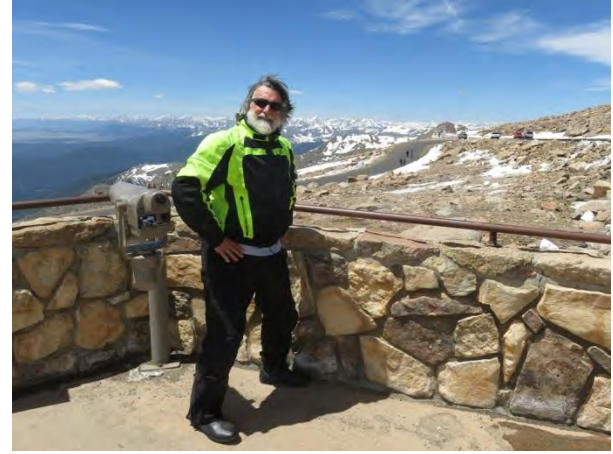
Van at the viewpoint on Mt. Evans

Our evening destination was a sweet <u>Airbnb</u> in <u>Silverthorne</u>. Having spent time in the area, he took us on a "refresher" tour around the spectacular <u>Dillon Reservoir</u>.