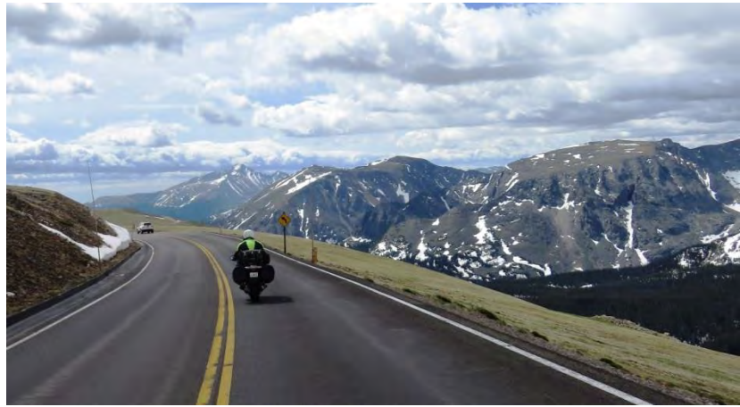
Van leads the way along <u>Trail Ridge Road</u> through <u>Rocky Mountain National Park</u>