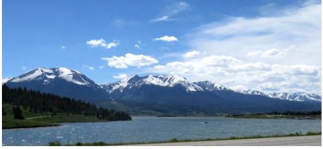
View across Dillon Reservoir near Frisco, Colorado