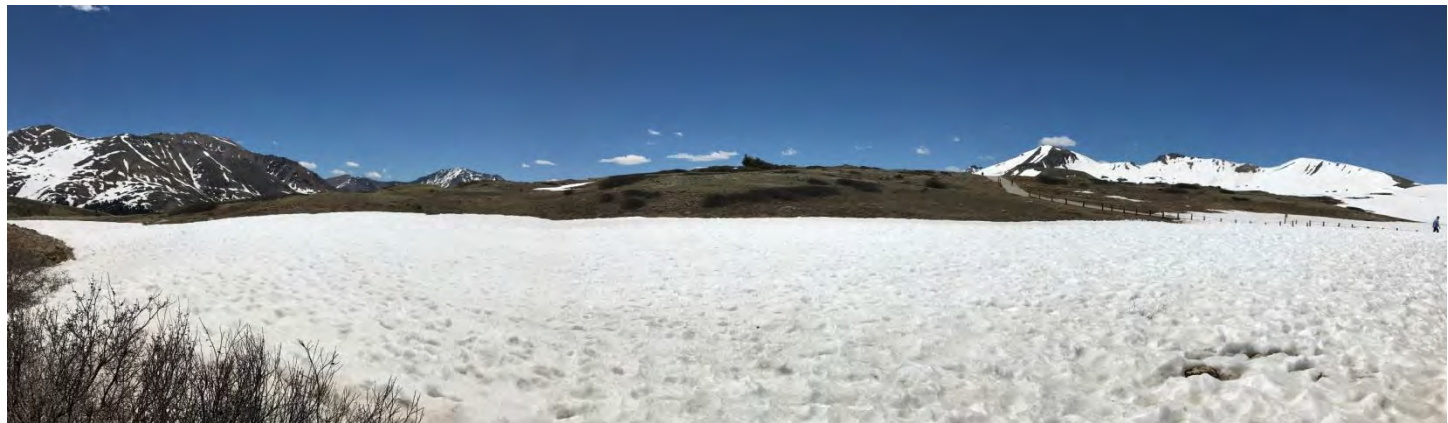
Panoramic View at top of Independence Pass