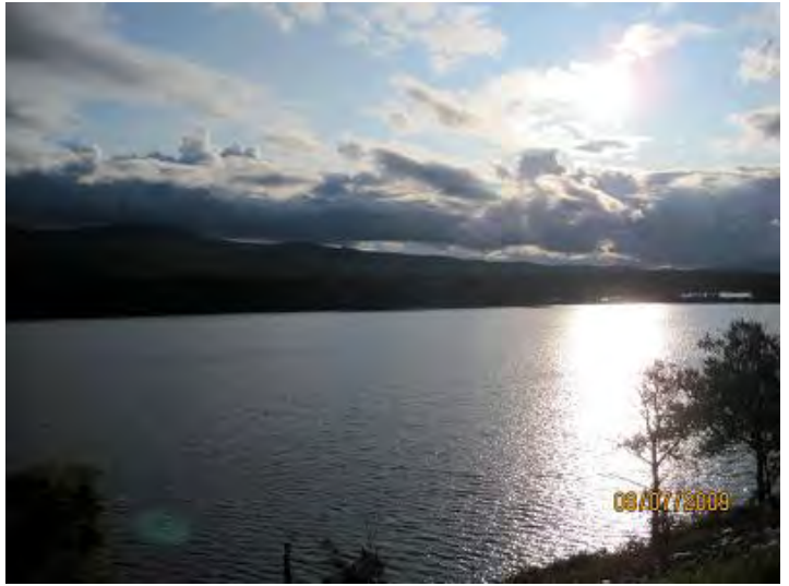
Lake Mégantic, QC

I then went thru customs in Gore, Maine. I forgot to take pictures as I had to disassemble my luggage so the border agents could make sure that I wasn't smuggling any liquor. As soon as I hit Rt. 27, the fun began. It was freshly paved and like a roller coaster. It's amazing how adrenaline wakes you up!!! The beauty of northern Maine is astounding.