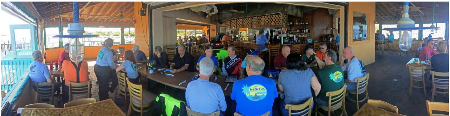
Panoramic Photo inside Squid Lips