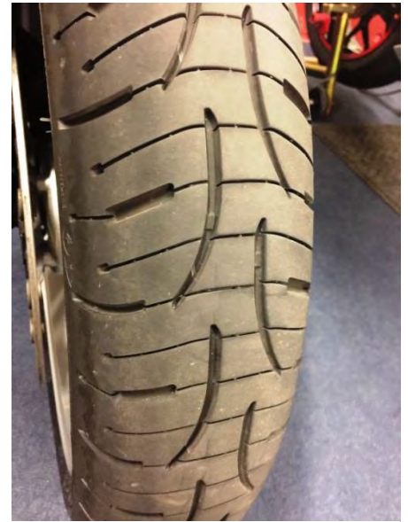
Michelin Pilot Road 4 (Front)

The tire manufacturers have long known that siping can increase wet weather and other low traction tire performance. Nowadays almost every major tire manufacturer uses some type of siping on its all-weather (street) tires. Just take a look at a Michelin PR4 and you'll see the highly precise siping patterns in the front and rear tires.