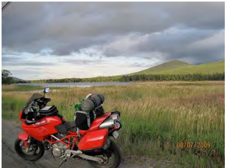
Just outside of Rangeley.

Again, it started getting cold and I had a chill that I couldn't shake. While I pondered camping, and passed plenty of places, I just couldn't bear the thought of sleeping in a cold tent. I needed warm....and some Crown Royal. I found a nice hotel in Rangeley that just happened to have a bar and restaurant on premises.....just what the Dr. ordered.