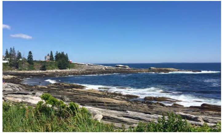
Brilliant coastal shot of distant islands and local lighthouse!