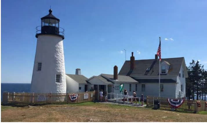
One of three working lighthouses that you can see from this location!! The <u>Pemaquid Point Lighthouse</u>. First built in 1826. Rebuilt in 1835 and again in 1857! The smaller buildings house a terrific museum!

His family goes way back in the area, and I enjoyed the grand tour of "here, my granddad did this...; my uncle use to own the entire point of land over there...; my dad built this pulley tower next to the lighthouse...". We had a terrific time together, ending with a dinner feast that words can't describe!!