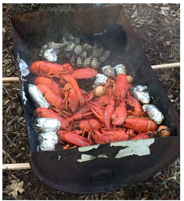
This is what they call dinner in Maine! This was for 10 of us. Imagine what it looks like when they feed 200! Absolutely delicious!!