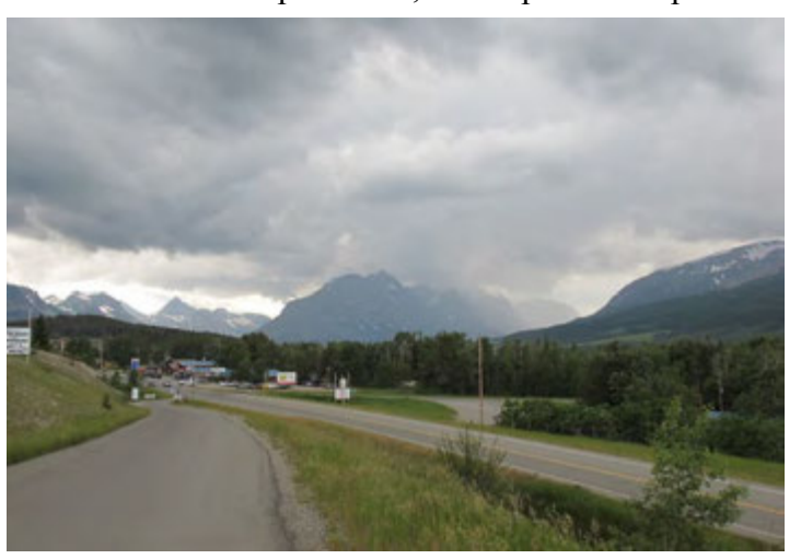
St. Mary Lake - as I'm headed back now

Lookin' over the top of town, back up in to the park.