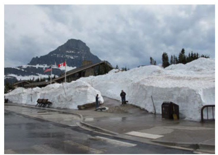
Lots of water coming down!

By now the visitor center was cleared out pretty good - this was at 6 PM.