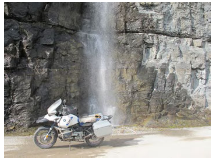
4 of 14 The Florida Gator Tale October 2016 <u>www.flmsta.org</u>