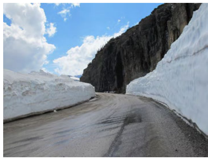
St. Mary Lake