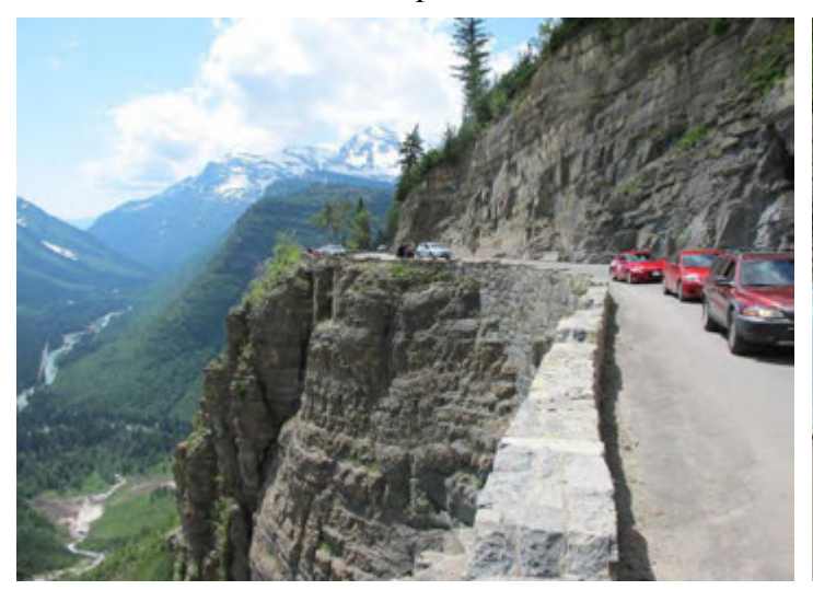
Looking at things like "Bird Woman Falls."