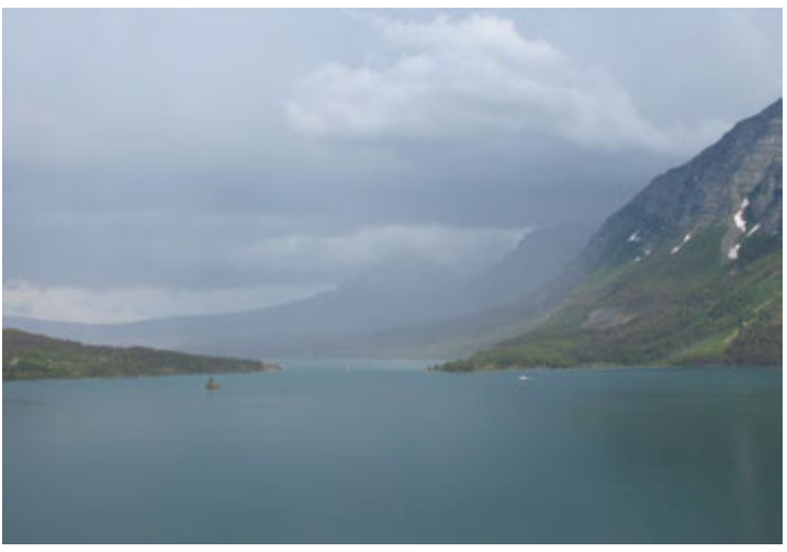
Yep, it rained; I stopped and just put a rain top over my 'stich. It really made everything smell very good!! We have sooo many wildflowers this year - as it has been a very wet spring.

By now the visitor center was cleared out pretty good - this was at 6 PM.