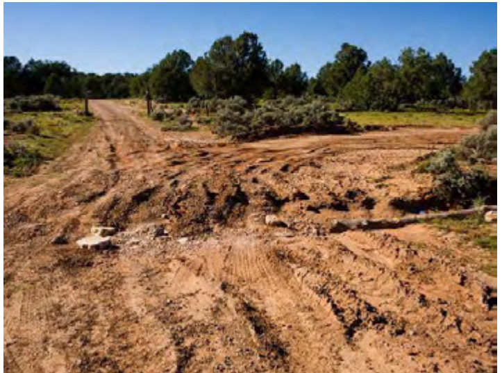
I leave the Tribal Lands and enter the National Forest...

The "road" went up a wash with heavy erosion damage. The trench and washouts crisscross the road requiring repeated crossings. At times the entire track was washed out with loose sand and rocks making it interesting.