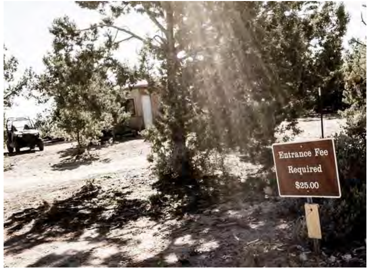
At this intersection I turn right onto the South Bass Road.

My $25 allows me access to about four miles of this "road".