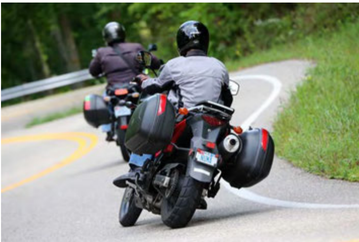
Getting diagonal on Rt. 129 at Deal's Gap.