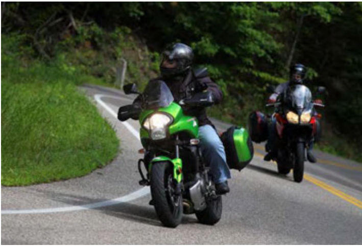
Like father, like son.