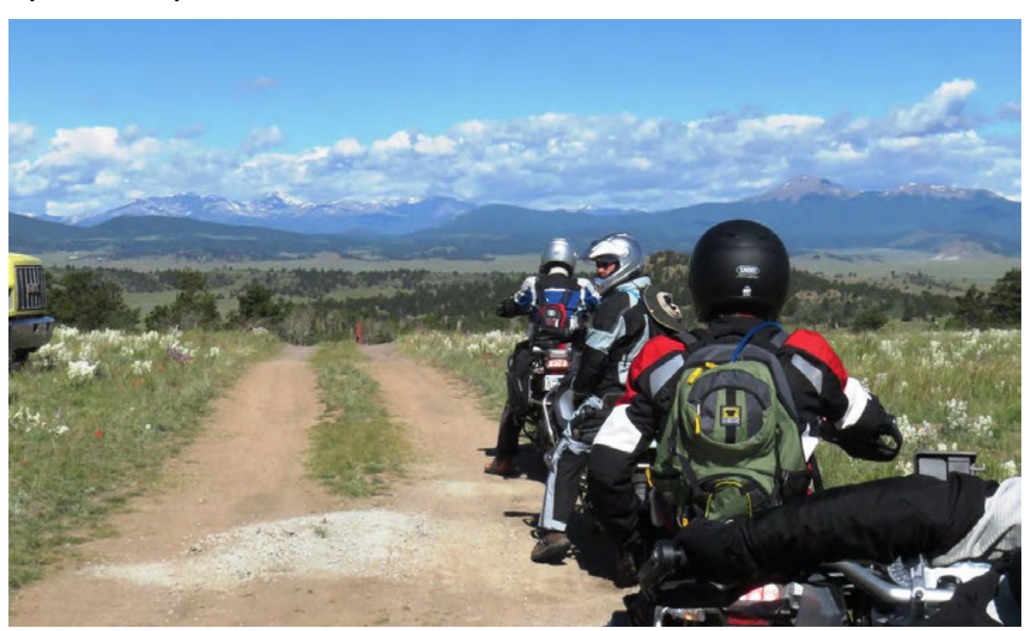
Saturday's training session was more intense than the preliminary session was on Friday. We initially headed south to the same training area as Friday and repeated the balance and other exercises for nearly three hours. At 12:30 we returned to camp for lunch. During the ride, I took this next photo as we were leaving the first training area. The wind was blowing our dust trails towards the south.