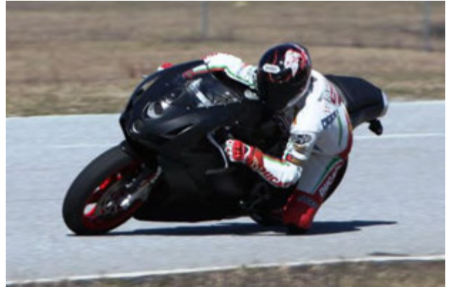
The author on the track at Jennings GP

It doesn't take a sport bike, the purchase of full race leathers and a lot of expensive preparation to experience a track day. Clubs will often promote track days for new groups or riders, and many schools offer track days to other than dedicated sport bike riders.