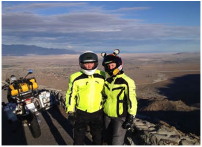
Looking out into the High Desert and Borrego Springs from Montezuma Pass.

Day 1 of our touring began with a run south on the PCH from Huntington Beach down to Newport Beach, just to see how the other one-percent live. You know the area is affluent when you pass an auto consignment lot and it is