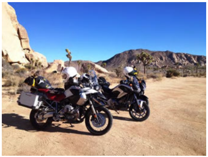
Casual off-roading stop in Joshua Tree National Monument.