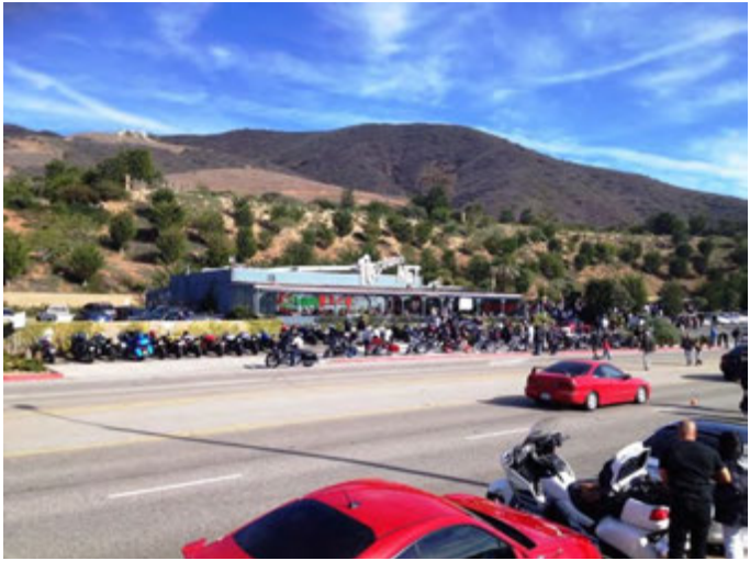
A great motorcycle hangout on the Pacific Coast Highway. Neptune's Net in Malibu on a busy Sunday morning.

Day 3 of our SoCal tour started out with temperatures in the 40s. We layered up and now aimed the bikes northwest. Our first destination of the morning, for brunch, was a little airport café at the airstrip serving Big Bear Lake resort. To get there we took a circular route through Lucerne Valley, then up the mountain to Big Bear Lake. Big Bear Lake is one of the premier recreation areas near Los Angeles, sitting above 6,700 feet in the mountains of San Bernardino County. Again it got a little cool on the ride up the mountain, but some hot beverages and brunch at the café made up for it. After brunch, we did a ride-by of the open ski resorts, then started back down the mountain, headed west back