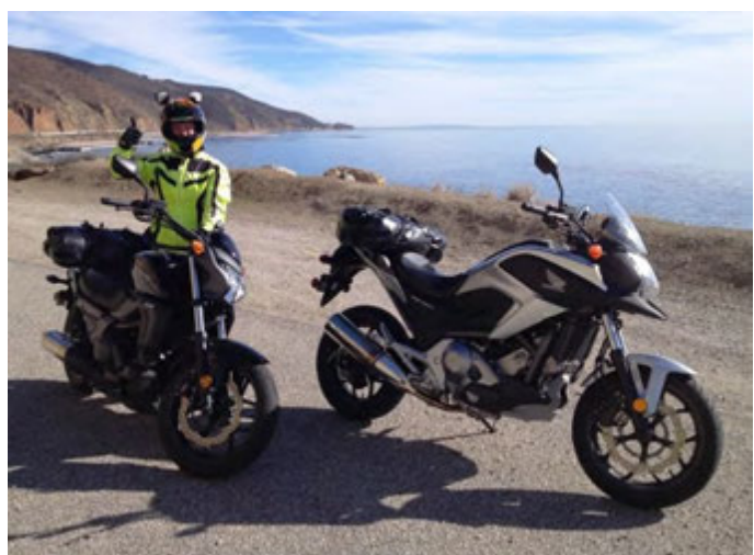
A beautiful day along the PCH! Honda was gracious in loaning us a NC700X and a CTX700N for our trip.

The next morning we thanked our wonderful friends and set out for ourselves. With great weather still beckoning, we turned our bikes north. Our objective this day was the Pacific Coast Highway (PCH), north of Los Angeles. That meant a quick ride up the infamous 405 freeway. Fortunately we have ridden in California enough that we're familiar with that most welcome technique of all: Lane Splitting. While it is not something we would ever do at home, it is not illegal in California and after