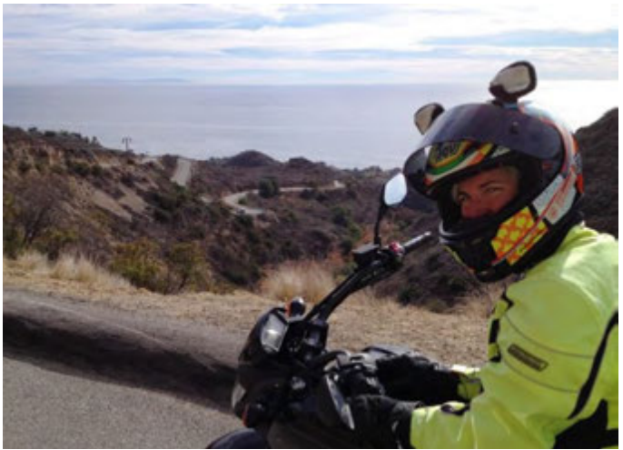
One of our favorite SoCal roads, Decker Canyon Road, above Malibu and the Pacific Ocean.

Our final day on the bikes started with a quick ride down to Oxnard for one of our traditions. We never go to CA without stopping at In-n-Out Burger for at least one lunch. If you haven't eaten there, you're missing out. You can't order anything but old-fashioned hamburgers and fries. Awesome! Then it was headed back south to drop off the bikes after lunch. Of course we couldn't take the direct route, so it was through the Potrero Valley (horse farms), then up through the canyon roads, including famous Mulholland Drive, etc. We finished up by dropping back down into Malibu via one of our favorite trails, Decker Canyon Road. After that it was south through Malibu, the 10, the 405 (more lane