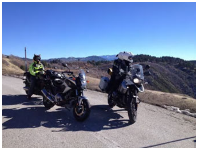
Headed west, down from Big Bear Lake. Still above the snow line!

have been known to show up on a Friday night, to play an impromptu set or two!