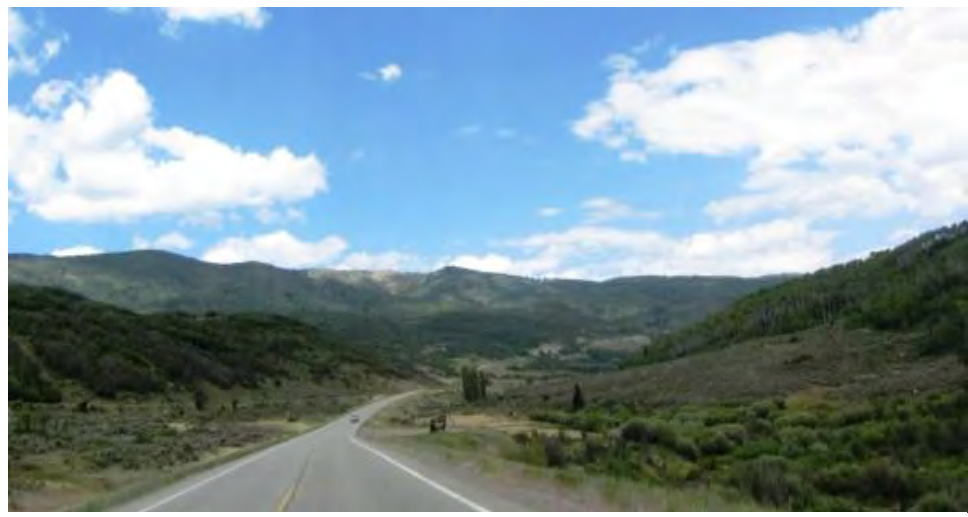
Leaving the Gunnison National Forest about half way between Hotchkiss and Carbondale

The Forest Service's sign ahead in this next photo indicates that we are at the northern border of the Gunnison National Forest.