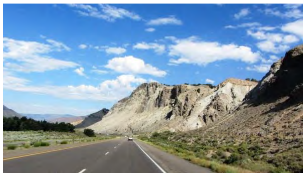
View of the terrain near the town of Gypsum

As I was leading our group during the leg to De Beque, the other riders are not shown.