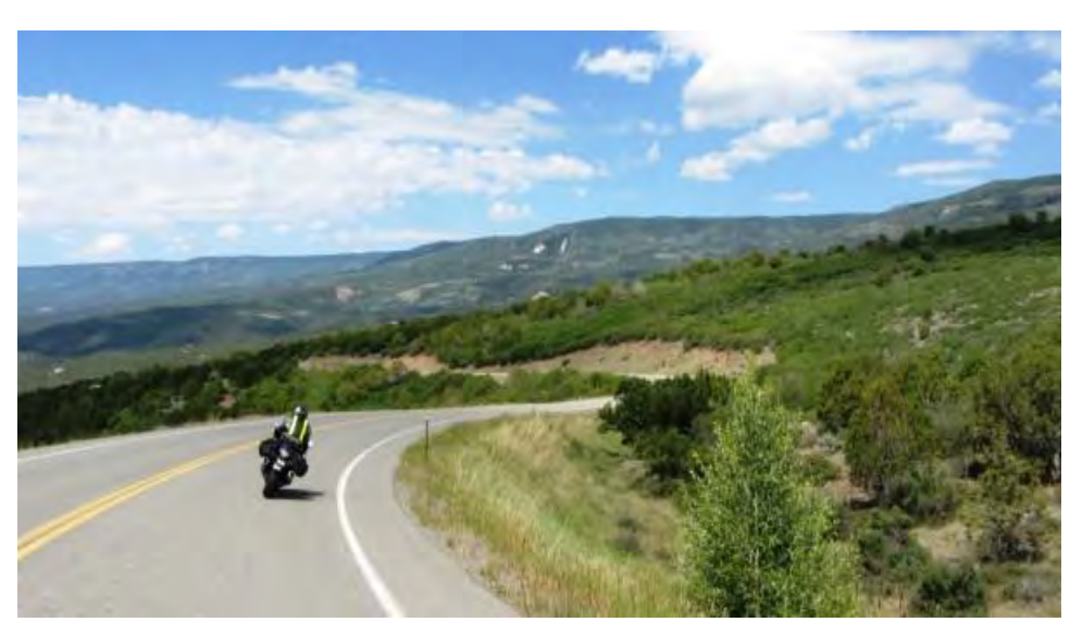
We all enjoy the sweeping curves, like this one, as well as much tighter ones

As on the north side, the road along the south side of Grand Mesa, offered many nice curves as we snaked our way down to the elevation of Cedaredge (6,300 ft).