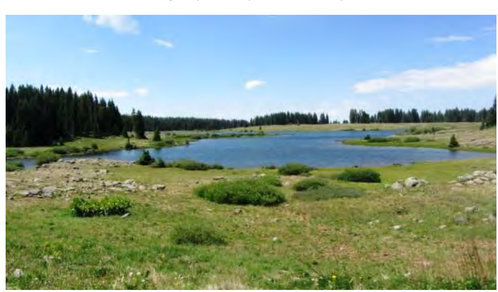
Grand Mesa Reservoir No. 9 at 10,600-ft elevation

Atop Grand Mesa we passed several reservoirs of small to moderate sizes, including this one at 10,600-ft elevation, named "Grand Mesa Reservoir No. 9."