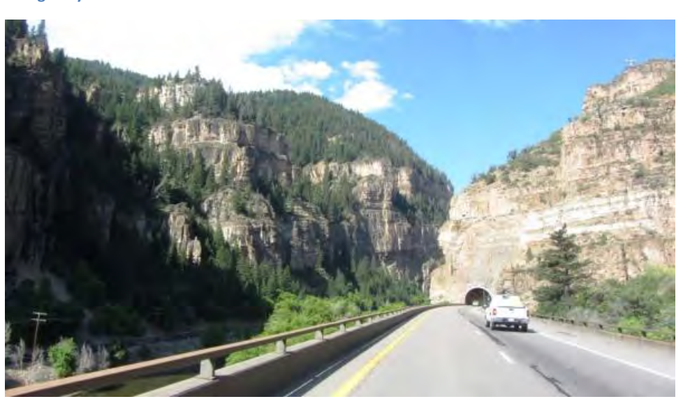
Approaching the first and very short tunnel for the westbound lanes