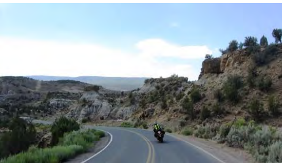
Van leads us south from De Beque along Hwy-45½

As the highway's elevation increased along the north slope of Grand Mesa, the view to the north became a grand vista. This photo shows one of the better views that I captured while riding.