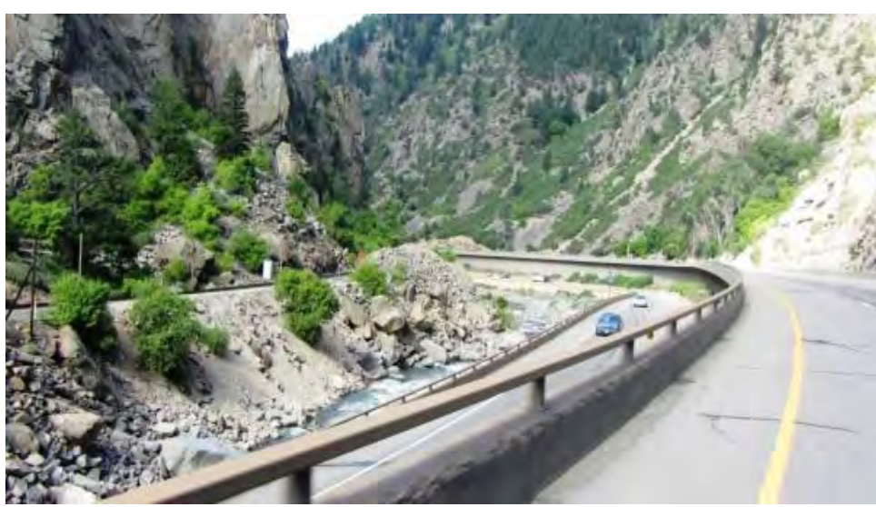
On the west side of the tunnel, the Canyon widens and the eastbound lanes are now visible.