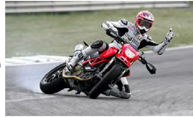
Unless you can do this reliably and repeatedly, you probably need traction control!

Case in point, and I'll tattle on myself here: Awhile back I was riding a Ducati Multistrada 1200S. Ducati in recent years has been at the forefront of electronic systems development in production motorcycles and the Multistrada is no exception. It has an outstanding adjustable traction control system. I was on one of my favorite back roads, hitting the corners fairly hard. In the middle of one corner I hit an unexpected patch of sand. The rear tire lost traction and started to spin and drift. Immediately I felt the traction control kick in. The system chopped power to the rear wheel, allowing the tire to slow and