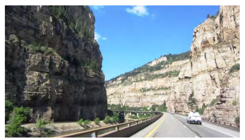
The Canyon narrows further. The railroad track is visible on the south side of the river.