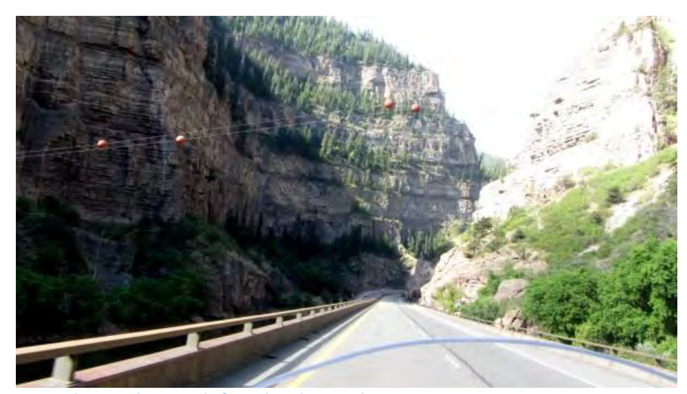
Approaching a tight corner before a lengthy tunnel