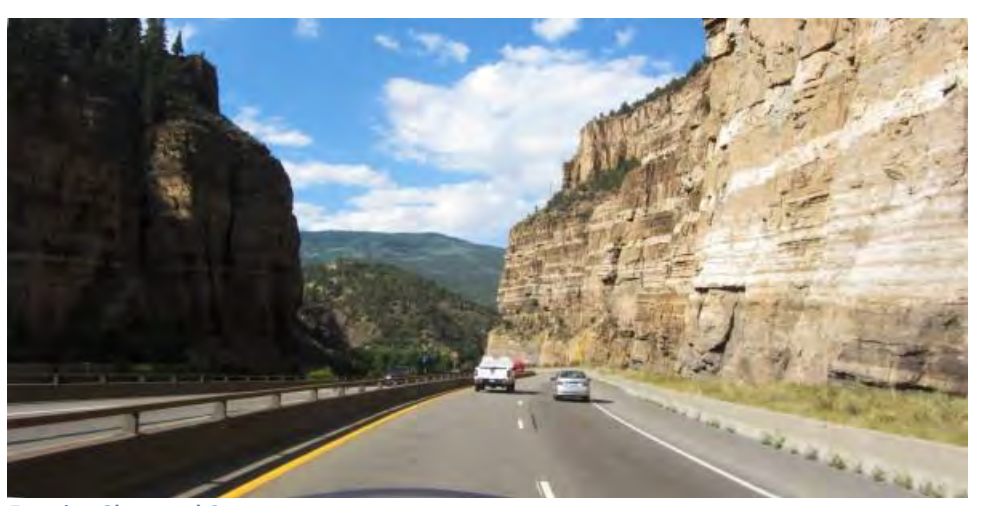
Entering Glenwood Canyon