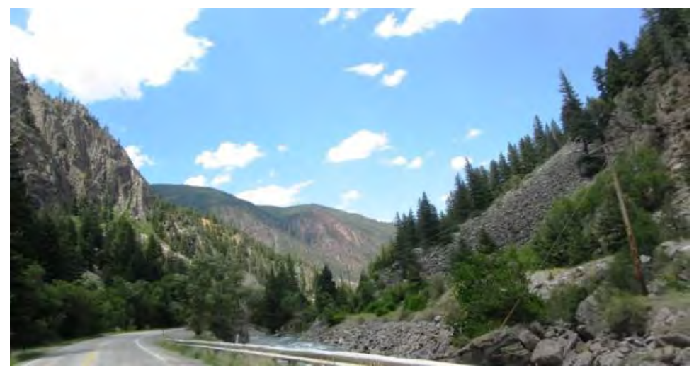
Although no more than a stream, Crystal River can be seen more clearly in this photo

From Glenwood Springs we retraced our path along I-70 and arrived back at the <u>Christie Lodge</u> in Avon by nearly 3:30 PM. We all enjoyed the lunch ride through some spectacular scenery! The lunch was good too.