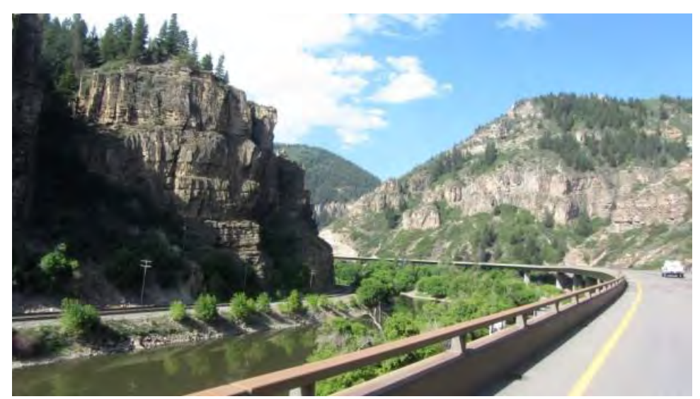
Numerous concrete pillars support the westbound highway deck