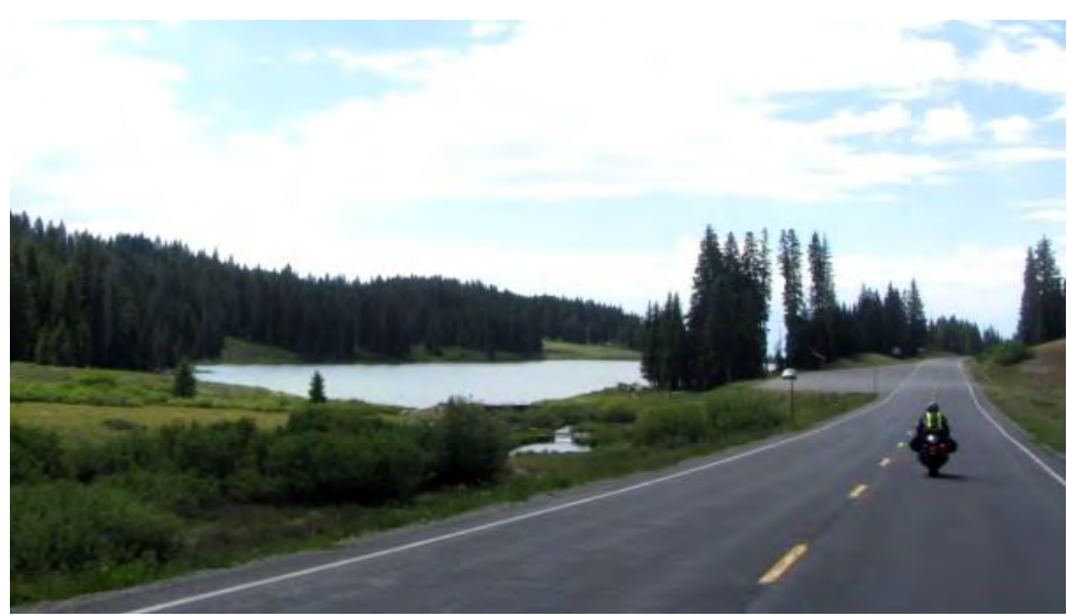
Riding past Ward Creek Reservoir along Hwy-65

This next photo shows Van leading us past the Ward Creek Reservoir at 9,800-ft elevation. Many of these reservoirs have obvious recreational uses, such as fishing, camping and hiking.