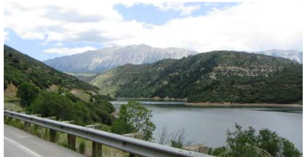
Paonia Reservoir in Paonia State Park

This photo shows a small section of the Paonia Reservoir