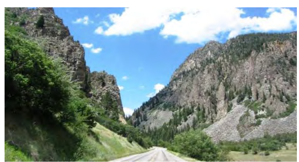
Riding through the canyon along Crystal River

These next two photos show another narrow canyon as the road and <u>Crystal River</u> squeeze through a narrow section.