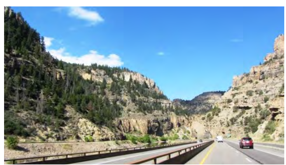
Approaching Glenwood Canyon from the east

This next sequence of eight photos shows the approach to and travel through Glenwood Canyon. It was quite an engineering achievement to construct a four-lane Interstate highway through this narrow canyon in an attractive and ecological manner in this environmentally very sensitive area along the <u>Colorado River</u>. There is also a single line railroad track on the opposite side of the river.