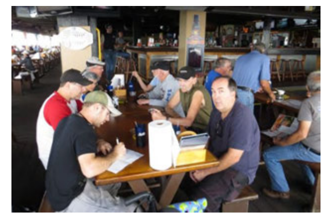
Our group had two tables on the open-air deck.

As for the South ride to <u>Harpoon Harry's</u>, I blew it!! The weather all the way over here near the ocean didn't change up until it was too late for me to alter my plans. I made the decision to not ride while it was raining, with thunder and lightning for added effect! By the time I would have left to make the rendezvous point, it was still debatable. But, I had already shifted my day's plans and riding wasn't in the works. Of course, it turned out to be a BEAUTIFUL day to ride to Punta Gorda! The reports back from several of the participants made it clear that next time, I need to wait until the last minute to decide go/no-go!!