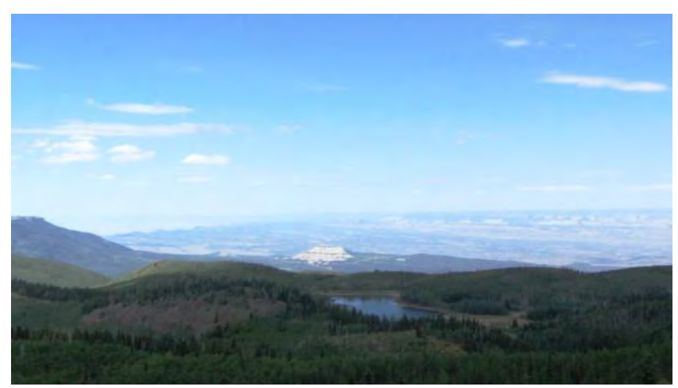
View toward the north as the highway snakes up the northern slope of Grand Mesa

Atop Grand Mesa we passed several reservoirs of small to moderate sizes, including this one at 10,600-ft elevation, named "Grand Mesa Reservoir No. 9."