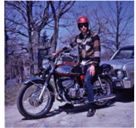
On my Bridgestone 350 GTR

I had trouble with the bike running properly all weekend so I left it at a buddy's house overnight. My sister, who lost her interest riding as a passenger, came and picked me up in her car. The next day with an extra 2-cycle oil bottle in hand, I picked up my bike to ride home. I chose a back street route knowing that if I broke down my friends would not see me pushing the bike. My theory was if I had blue smoke coming from the exhaust that the oil injectors were working. All the way home I closely watched my exhaust pipes instead of the road in front of me. Again, I bet you have an idea what happens next!