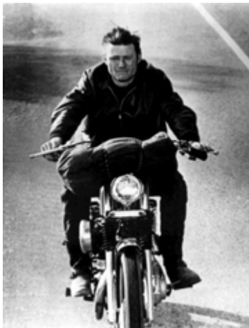
Michael Parks as Jim Bronson (1969)

Back in those days there were no rider training courses and very little safety gear available to riders. Motorcycle brakes often took a city block to stop the darn thing and tires... well let's just say that there was very little lean angle capability prior to