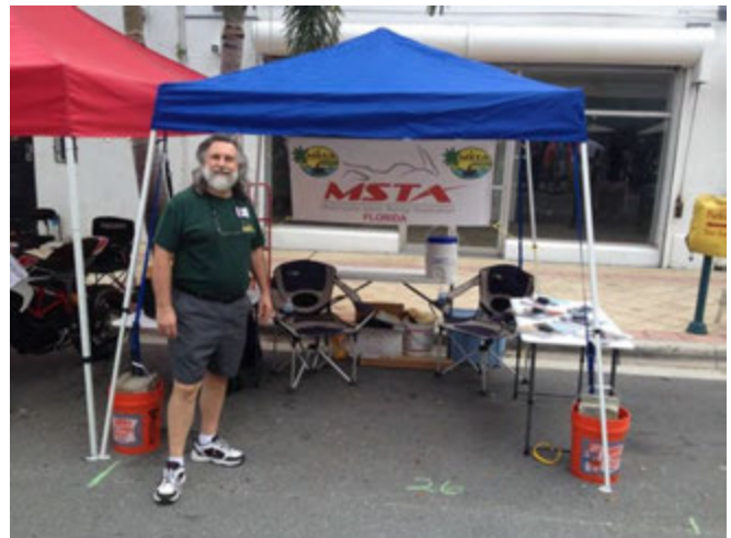
2014 Vintage Iron Motorcycle Show