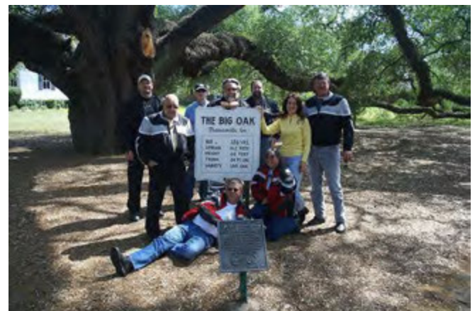
2007 Thomasville Just-For-Fun