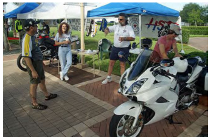
2009 Riding Into History