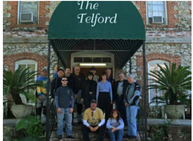
2011 Alachua Just-For-Fun