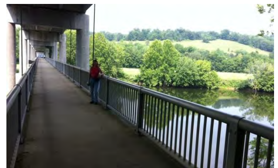
Walkway at James River