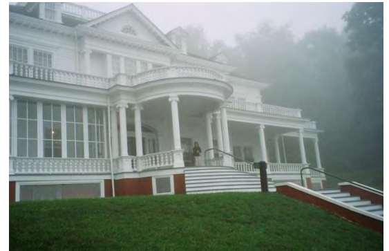
Moses Cone Manor House

The next morning we found our way to the James River Visitor Center. There is a footbridge constructed beneath the Parkway