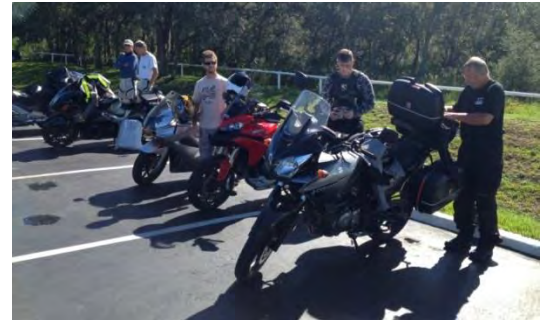
At Sebring Diner

Camp. Our brunch ride didn't match the numbers we had for our lunch ride to here last year!! Nonetheless, a good time was had by the small group. And we had a similarly small crowd for our last brunch ride of the summer to the Sebring Diner. The weather may have been a factor for that ride, as the Eastsiders left on damp roads, but only encountered a brief sprinkle along the east side of Lake Okeechobee!! Or, perhaps some were prepping for the SE Rendezvous!! I heard nothing but good things about that weekend!!