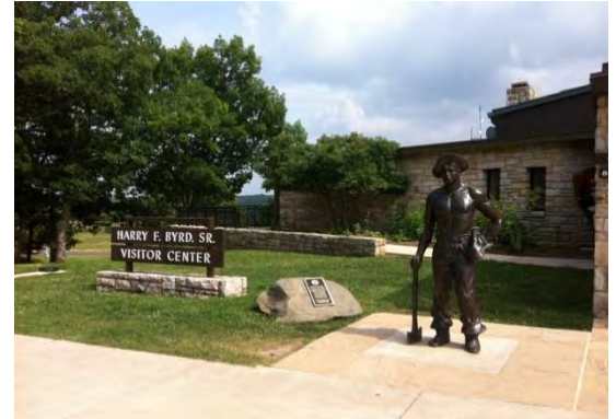
Harry F. Byrd, Sr. Visitor Center

We stayed at Big Meadows that evening. This is near the Harry F. Byrd, Sr. Visitor Center. According to my diary, I had a good chicken dinner and we split the blackberry cobbler and blackberry ice cream for dessert. After dinner we wandered into one of the lodge rooms with a large fireplace and rocking chairs set up facing the mountain view. That gave us a chance to sit and relax a bit before heading back to our room.