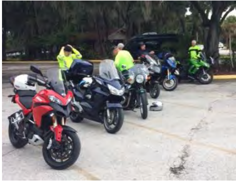
At East Lake Fish Camp

We had our last two brunch rides this month. The Central ride was back to the East Lake Fish