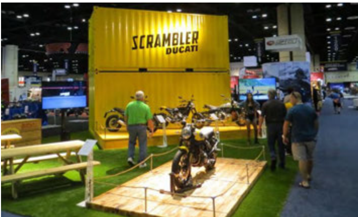
Ducati promoted their new Scrambler