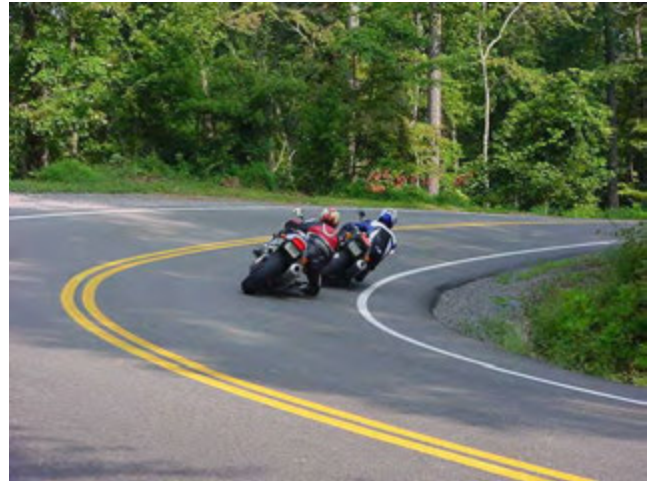
Sport bikes on the Tail of the Dragon

We were the first ones at the meet-up location, and as we waited the bikes started rolling in. The ride planner had told us to expect about 8 bikes or so. When the number went past 10, I started to take note of who was showing up. We recognized about half of them, and the other half were complete unknowns. All on sport bikes, mostly Ducatis, but that wasn't the issue. After all, I've got my Duc in the garage as well. The issue was seeing race suits with (unscuffed) knee pucks on one or two and yet other riders way less than ATGATT. Neither of these is necessary for and/or appropriate for the street. However, they do tend to suggest a type of riding mentality.