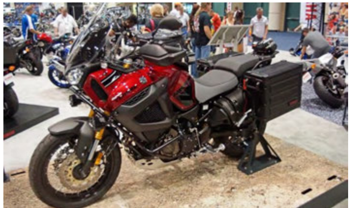
Yamaha displayed the 2015 Super Ténéré