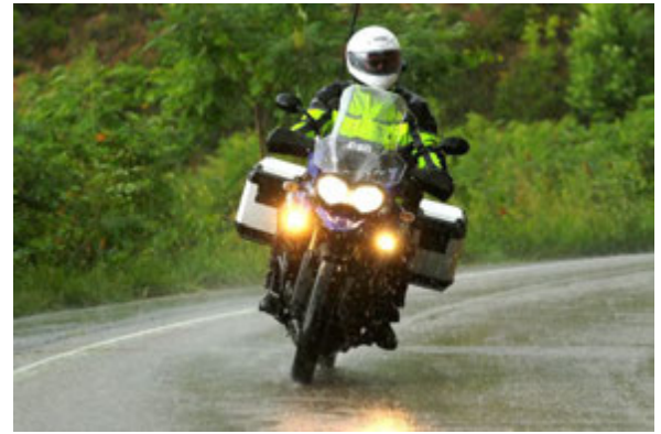
Jim Park in the rain on the Dragon

1 Expect Rain: Even if the sun is out, and there's not a cloud in the sky before leaving home, expect the possibility of rain during any ride that lasts more than a couple of hours. That means riders should almost always pack rain gear. And, by the way, most textile riding gear that says it's rain resistant, or even waterproof, usually isn't in long, soaking rainfall. So pack your rain gear!