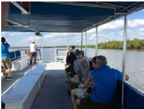
Heading out to the Gulf...