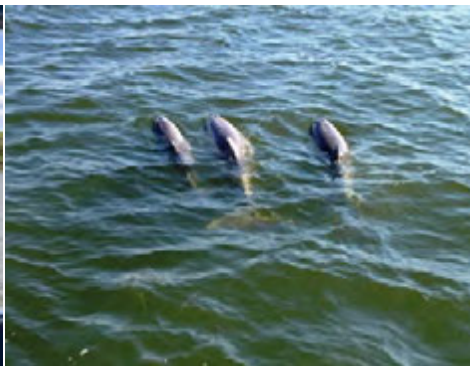
Dolphins surface alongside the boat