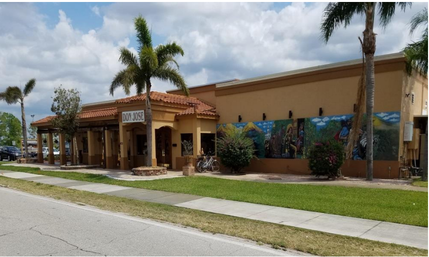
Don Jose's Mexican Restaurant - Sebring, FL

Apparently, there was consternation among some of those arriving early about whether or not Don Jose's was even going to open. There were signs of construction work in the patio area and they still hadn't opened by