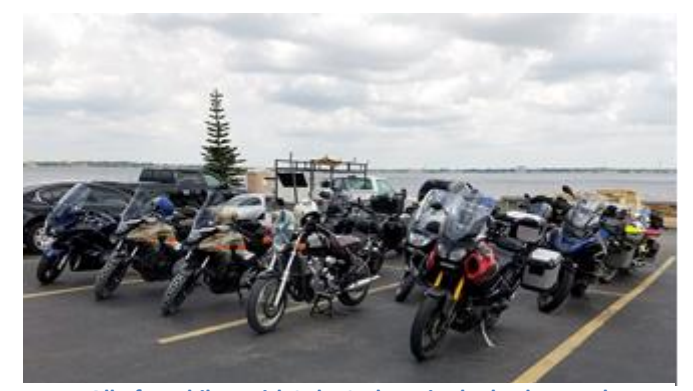
All of our bikes with Lake Jackson in the background

The place has a lot going for it. First, it's a colorful and attractive property. The restaurant and the paved parking area are sizable. It's on the lake with a great view. They offer a menu to satisfy nearly all tastes. The menus