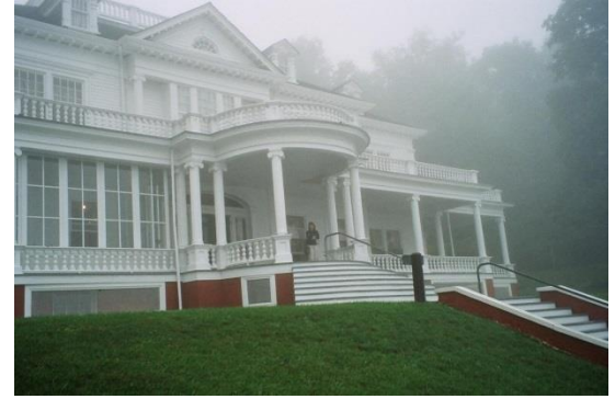
Moses Cone Manor House

However, Moses Cone Manor House and Craft Center is a must stop. When the weather is clear it's a welcome stop if only to pause for a while on the porch overlooking the mountains and lakes in view. We decided that it's still picturesque even when fogged in!