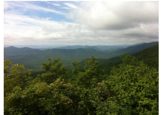
View from Pisgah Inn

Pisgah Inn, Milepost 408.6, was our first lodging and fortunately not far from Townsend where we began our day's ride. Rain persisted and we welcomed an early stop at Pisgah. It was quite cool because of the high altitude and the dampness chilled us to the bone! Pisgah Inn is by far our favorite place to stay on the Parkway. From the porch of the second floor rooms, it's enjoyable to sit in the rockers and enjoy the view of Pisgah National Forest , even if it's cloudy and rainy! The restaurant at Pisgah is excellent also and it's open for breakfast, lunch and dinner. That evening I finished off my dinner with their chocolate silk pie. Yum! Save room for the desserts.