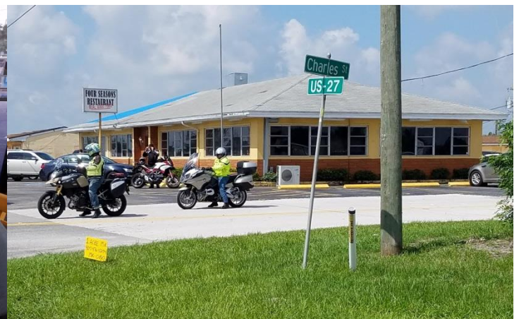
Four Season's Restaurant, Frostproof as we were leaving