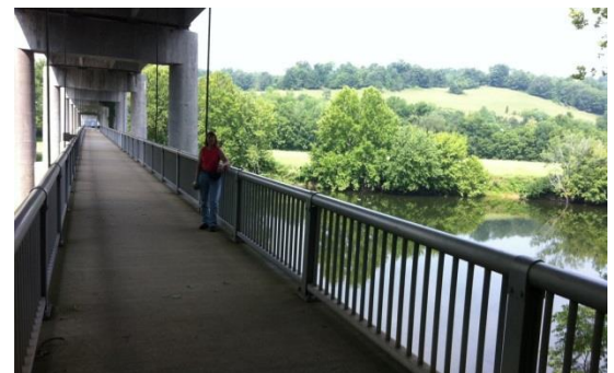
Walkway at James River

The next morning we found our way to the James River Visitor Center. There is a footbridge constructed beneath the Parkway where it crosses the James River. We enjoyed the views from this vantage point. We continued walking across the footbridge and followed the trail leading to a lock (built between 1845 and 1851) remaining from the James River and Kanawha Canal .