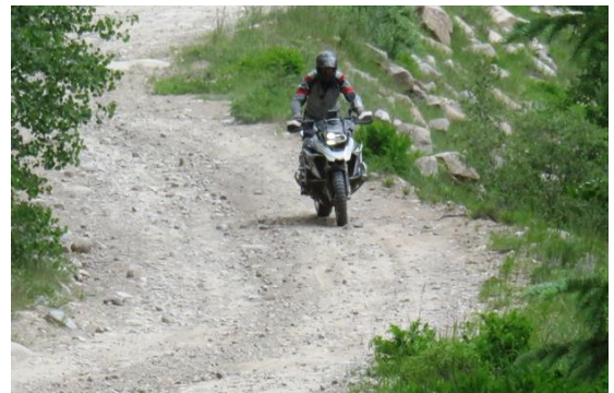
Training at Rawhyde-Adventures