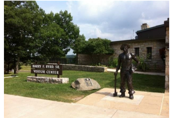
Harry F. Byrd, Sr. Visitor Center

We stayed at Big Meadows that evening. This is near the Harry F. Byrd, Sr. Visitor Center . According to my diary, I had a good chicken dinner and we split the blackberry cobbler and blackberry ice cream for dessert. After dinner we wandered into one of the lodge rooms with a large fireplace and rocking chairs set up facing the mountain view. That gave us a chance to sit and relax a bit before heading back to our room.