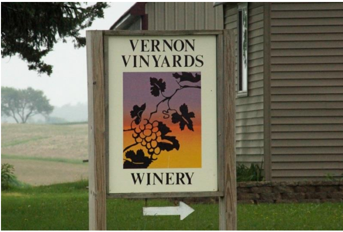
Vernon Vinyards Winery provided the venue for the STAR lunch event