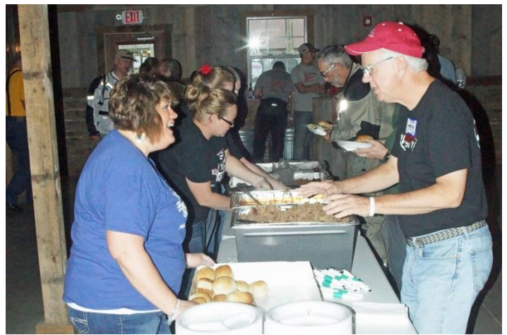
The catering staff dished up an equal portion for each attendee.

The Closing Banquet!! (#345 & #668) Admittedly, the food quality ranges... although the vegetarian options at every STAR that I've attended have been terrific! I'm just saying. Hint-hint.