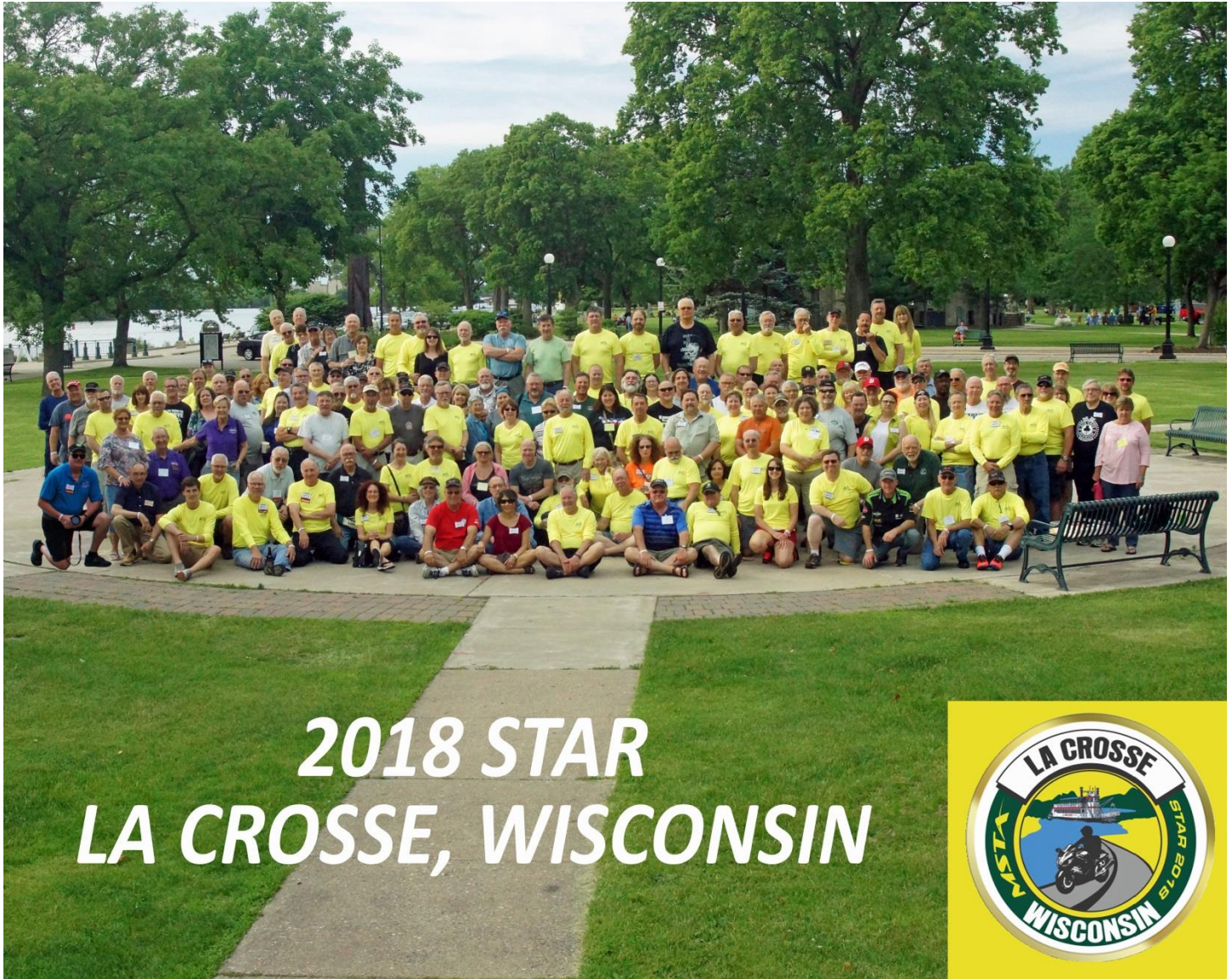
Group Photo of Attendees at STAR 2018 Taken in City Park between Radisson Inn and Mississippi River