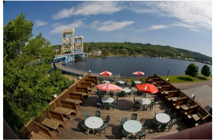
View across waterway from Downtowner Lounge

For anyone who might know the town, we started out at the Downtowner for a happy hour drink and from their outside deck, had a direct view of the unusual (to us) lift bridge that connects across the Keweenaw Waterway to Hancock, MI. There were also a number of helicopter tours taking off and landing on the river's edge in Hancock which added activity to the unique and pretty setting.