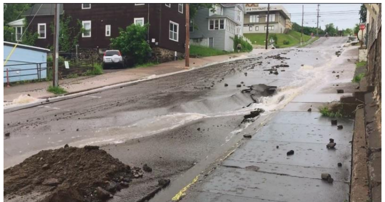
Flooded street in Houghton. Click for video.

With a nice clean room and fresh sheets to crawl into after getting our belongings to the second floor, I somehow managed to be sound asleep in about 2 minutes. Poor Jim! He was awake the rest of the night, and like usual, gets up quite early even though he did not get much sleep. So he was out surveying the sad situation very early the next morning, finding the store fronts and restaurants we had so enjoyed just the evening before with busted out windows from the impact of the water surging down the street. Jim recalled that there actually had been a bench in front of one of the restaurants - where now there was no bench - just a sinkhole!