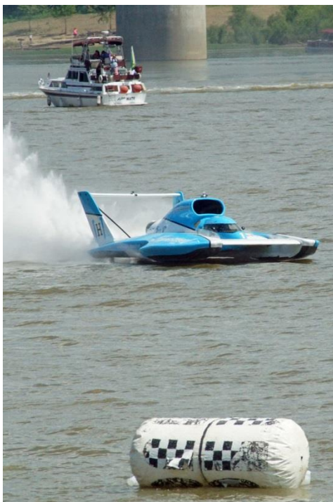
Madison Hydroplane Race

The only hot weather we endured was in Madison , Indiana.