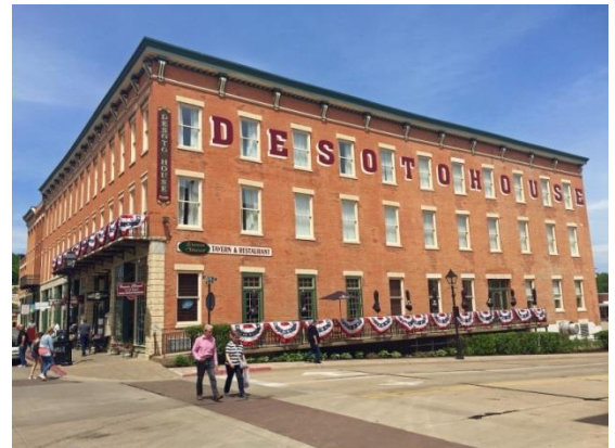
DeSoto House in Galena, IL