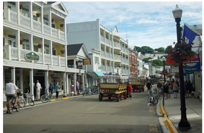
Mackinac Island, MI