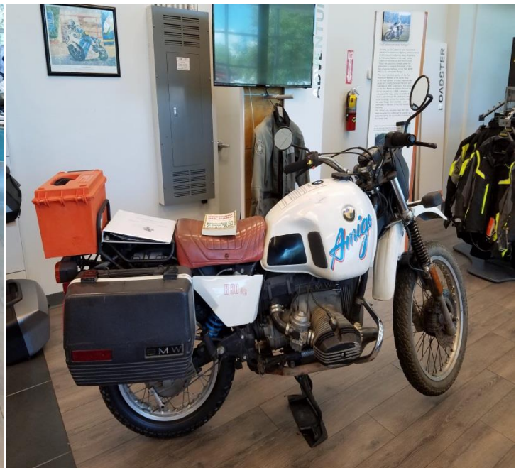
Amigo in profile at Power BMW of Palm Bay.