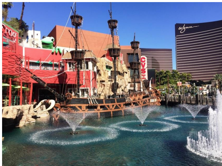
Pirate Ship at Treasure Island Hotel