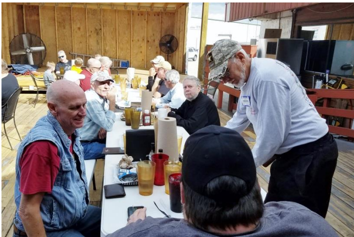
Our table from both ends

Hardly a four-star restaurant, but plenty good for our needs and in just the right spot.