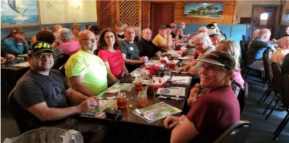
A little over half of our crowd around the center row of tables. The group to the left was not with us.

Nearly half of the attendees were from the west central area as expected. But we had participation from each segment of the state except the far northeast and way out in the panhandle.