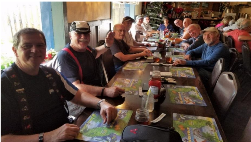
Our 2 nd row of tables – happy, hydrated, hungry