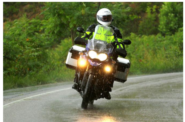
Jim Park in the rain on the Dragon

1 Expect Rain: Even if the sun is out, and there's not a cloud in the sky before leaving home, expect the possibility of rain during any ride that lasts more than a couple of hours. That means