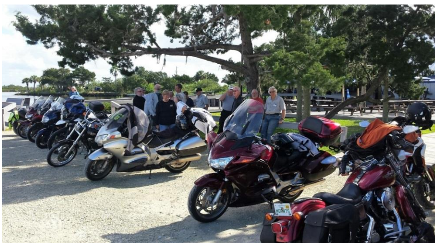
More of the same

the day. For January 1 st or any time of the year, it could not have been a more pleasant day to ride.