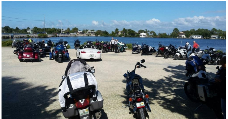
Here's a smattering of our bikes and riders. How about the background?