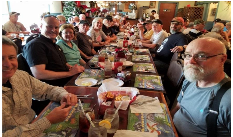
Same row of tables from the other end