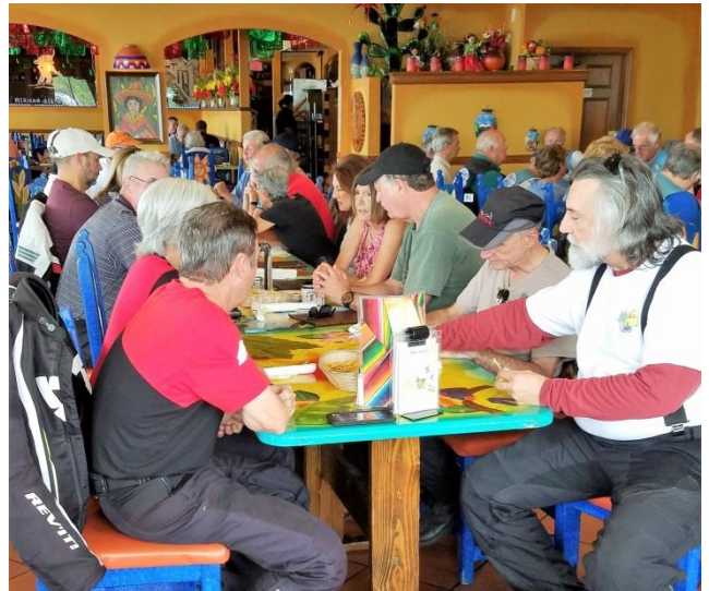
Our group at Don Jose's Mexican Restaurant on 4/7/2018.