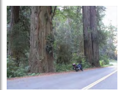
Prairie Creek Redwoods SP south of Crescent City, CA

I left Oregon and the Pacific Northwest and headed into California and Nevada.