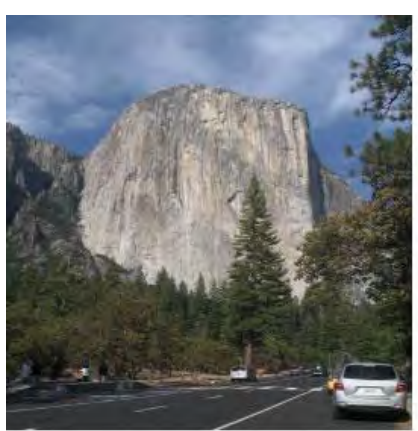
Three shots from Yosemite Valley

Yosemite National Park. This was one of the most exhilarating rides of the trip. It lasted the better part of the day. The road was in great shape but very narrow, very twisty and with deep, abrupt, unprotected drop-offs in many places. I will never forget portions of that road!