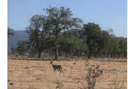
Volcanic rock-strew land WNW of Lassen Volcanic NP

The next morning, my GPS, set to 'shortest route', guided me to Lassen Volcanic National Park to the east-southeast along twisty, narrow roads that were not on the map - a great ride. The land was strewn with rock. Vegetation was sparse and scrawny. Here and there, there were a few horses, cattle or an occasional deer, but no crop fields. After reaching the park, I read that the first eruption spewed rock a hundred miles to the west, which explained what I had just seen. A second eruption, actually from a separate but adjacent volcano, occurred in the early 1900's. The visitor center is situated within the latter's crater. Good lord!