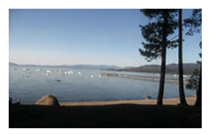
View from South Lake Tahoe

I reached <u>Lake Tahoe</u> at the north shore and followed the road around the eastern (Nevada) rim to <u>South Lake Tahoe</u> on the California side where I spent the night. Gambling and clubs were in full swing on the Nevada side. The lake is large, offering all sorts of aquatic opportunities. In the winter, the surrounding mountains are full of skiers.