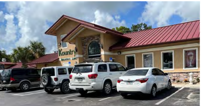
JR, Larry and Buck at the Kountry Kitchen in Immokalee