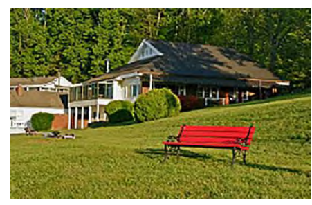
Big Lynn Lodge in Little Switzerland, NC

The Big Lynn Lodge Rally at Little Switzerland in western NC was coming up in mid-July, and Rose was as anxious as I was to get out of the Florida heat and humidity and spend some quality time in the cool mountains. She doesn't ride any more so we decided to trailer the KTM –