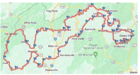
"Lots of Turns 225-mile Loop" in NC