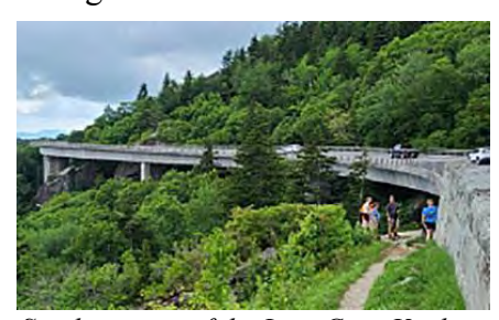
South portion of the Linn Cove Viaduct

On Monday, we drove north on the parkway to Linville Falls and spent most of the morning hiking up to four of the falls' overlooks – great views and what a workout! Felt good.