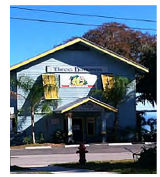
3 Bananas restaurant in Crescent City, FL

When we got back in the car, neither the Audio, the Navigation, the car-activated Phone, the Climate system, the Apps panel nor the Settings menu worked. The center display screen had frozen. I could use my cell manually and some separate temperature controls but not via the touch display nor steering wheel buttons. Mostly, I missed the Nav but had traveled to 3 Bananas enough to remember the way home. So we were OK. Thank goodness it hadn't happened earlier.