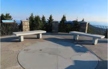
Atop 6684-ft. Mt Mitchell and on the observation deck

near the top, but there are about a hundred yards or so of moderately steep hiking path to get to the observation deck at the summit. And up there, you have great views in all directions.