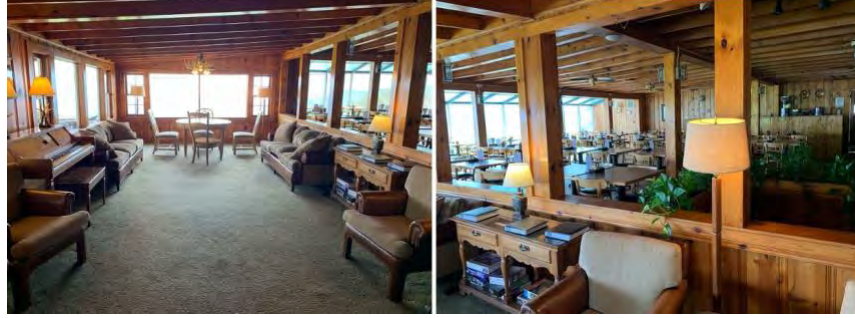
The comfortable lounge and adjacent dining area at the lodge

Seating in the lodge's dining room is assigned by room number. We happened to be next to a couple from Ohio – Bryan and Karen. After conversing at length over three meals, the four of us (along with everyone else) had a very enjoyable Friday evening listening to a local band called "Almost Vintage" and drinking our fill of adult-beverages. They played a variety of rock and country hits from the outdoor