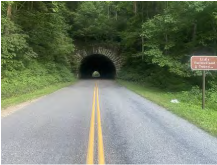
Tunnel under the Blue Ridge Parkway