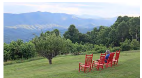
Valley View from Big Lynn Lodge ☺ MSTA

For times when you want to socialize or just relax but not outdoors or in your room, there's a large, carpeted sitting room adjacent the dining area with comfortable chairs and sofas, a table for cards or jigsaw puzzles and one wall covered with shelves full of books and magazines. There's even a piano. And, yes, it has the same grand views.