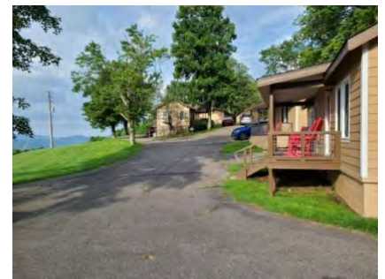
Cottage Porches at BLL ☺ Blake

What doesn't change, however, are the delicious breakfasts and dinners with desserts ( vittles , they're called in them thar parts ). The two meals are included in the room rate, and we all eat together. They even ring a bell when the food is ready. Attentive and friendly servers appreciate tips. We're on our own for lunches.