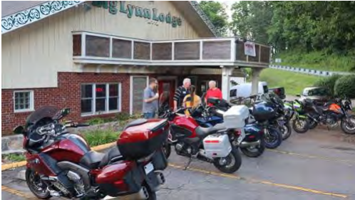
BLL Office ☺ MSTA