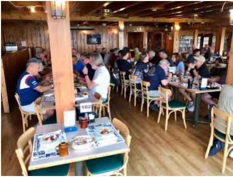
BLL Dining Room ☺ Pippin

The Lodge has been in existence for over 100 years. Today there are 38 rooms and 4 suites – some in motel-like structures, some in single or grouped cottages with mountain views, some with 1 bed and some with 2. All include porches with rocking chairs and adjacent parking. Accommodations are clean and comfortable though not fancy. Owner, Hoyt Johnson, is constantly updating and making improvements.