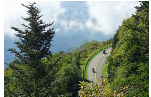
The Blue Ridge Parkway a photographer's playground

majestic overlooks to pull over and enjoy. It's a photographer's playground. A word of warning - there are no gas stations on the Parkway . So, do your homework in advance to know what exits offer nearby stations as the Parkway is 469 miles long! If you're a camper, there are several to choose from on the Parkway. There's lodging along the Parkway for us non-campers at the Pisgah Inn and further north at the Peaks of Otter - both have good restaurants with fantastic views. They run a bit on the pricey side, but keep in mind that you're paying for the location which is fantastic at both lodges! Convenient lodging can also be found just off of the Parkway near Waynesville, Asheville and Roanoke just to name a few. You can ride the length of the Parkway in under two days, but it's well worth it to travel it in three to four days to take in all of the many sites along the way.