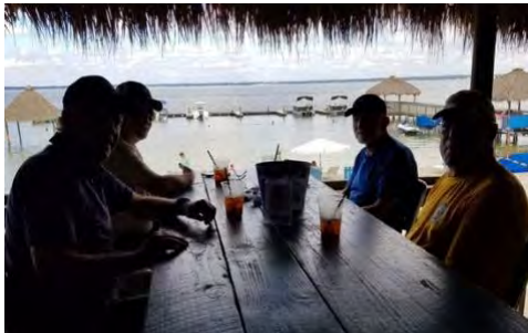
Sitting outside with a view of Lake Weir

All of the completely outdoor seating had been recently taken by the time we got there. So, not wanting a lengthy wait, we elected to be seated next to the floor-to-ceiling openings along the whole north-facing building perimeter. We had a beautiful view of Lake Weir with boats, paddle boards... even a stunt bi-plane doing a few loops with smoke billowing behind. The food was good although a bit pricey. I think this place is a keeper. Thanks again, Roy.