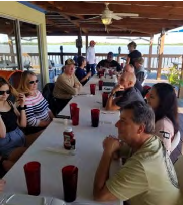
Great lunch with new friends