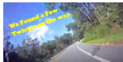
Click the photo to watch a great video of the Central Ride!