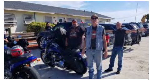
Made it to Goodrich's after a good ride with old friends