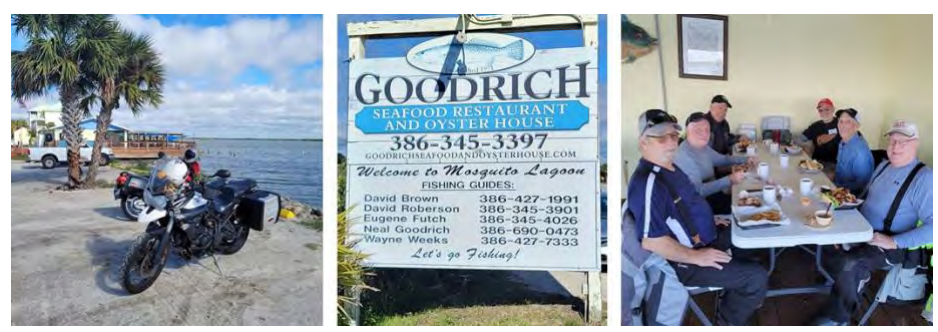
We ate great food on the porch overlooking the Indian River at Goodrich.

The ride home was dry, and the weather beautiful.