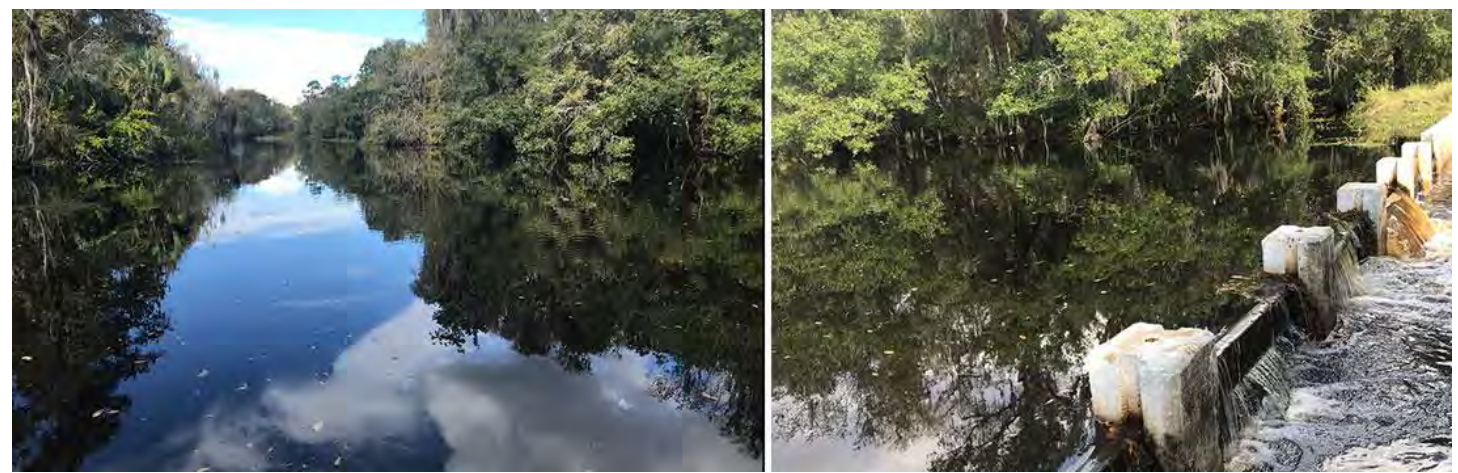
Pond behind a weir-axel deep crossing: Water is everywhere! Without the maze of drainage canals that we are habituated to, water flows continuously southward through the property. More evidence to follow...

The preserve protects important water resources, diverse natural habitats, scenic landscapes, and historic and cultural resources. The agricultural integrity of the land is maintained by keeping the fully operating cattle ranch intact. The preserve is also home to a number of endangered species, such as the crested caracara, gopher tortoise, Florida burrowing owl, Florida panther, Florida black bear, and several native and migratory birds. The area spans a diverse number of ecosystems, with pinelands, dry prairie, and cypress swamp. The wetlands contribute to aquifer recharge and help maintain the health of the Western Everglades ecosystem.