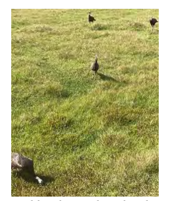
Wild turkeys: These locals know the tour schedule!! It helps that the driver has a supply of corn to "hand out" along the way.

Birds are abundant at Babcock Ranch. In addition to wild turkeys, there are a number of migratory and native Florida birds that you can spot as you move through the different ecosystems. This includes sparrows, falcons, woodpeckers, burrowing owls, limpkin, and sandhill cranes. It makes us a great spot for birding enthusiasts!