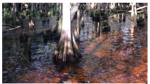
Cypress swamp and "knees": We're in 18 inches of moving water!!

Today, Tarpon Blue Land & Resource Management continues to manage the preserve for the state. It remains an important part of Southwest Florida nature to preserve the natural ecosystems and wildlife, as well as help maintain the health of the western Everglades ecosystem. The preserve is open to public recreation through hunting, hiking, wildlife viewing, bicycling, fishing, and camping.