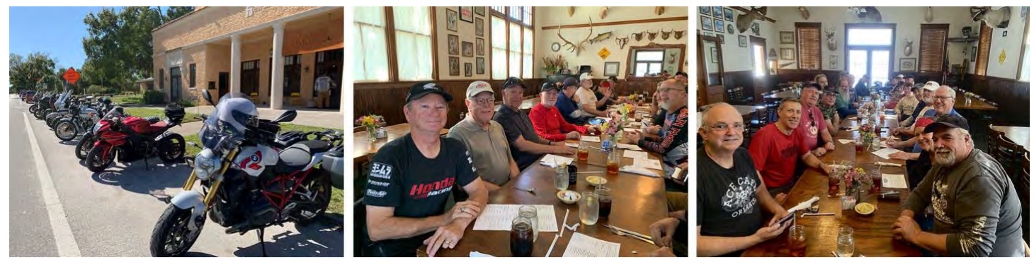
Great turnout for the Black Friday Lunch Ride at Marsh Landing in Oak Hill