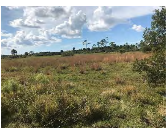
Fresh-water marsh: Just yards from the Gator Shack, this expansive marsh hides 4-6 inches of slowly moving water under a thick "carpet" of plant life. Medicinal plants, small animals and plenty of insects call this home. And lots of birds call it "groceries"!