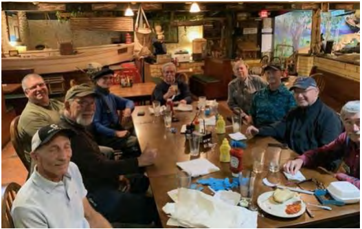
At The Yearling restaurant – unique décor