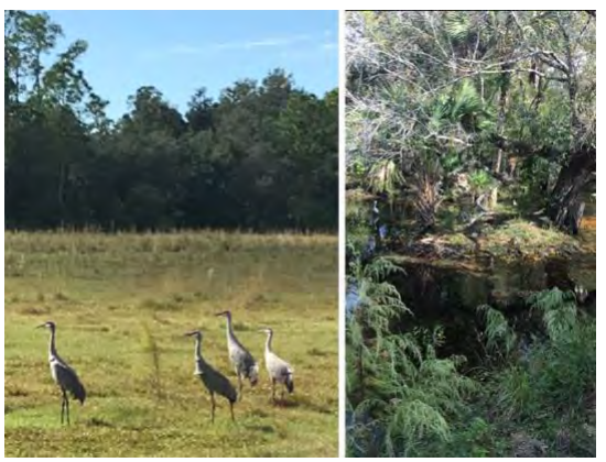
Whooping cranes: A constant presence on the ranch, these birds mate for life and enjoy the vast area of natural habitats, like real swamp, key to their survival. Cranes in Florida do not migrate.

White-tailed deer is a medium-sized deer native to North America that you can see roaming through Babcock Ranch. They are known for their reddish-brown coat in the spring and summer and turn to a grey-brown throughout the fall and winter. They can be identified by the characteristic white underside to its tail.