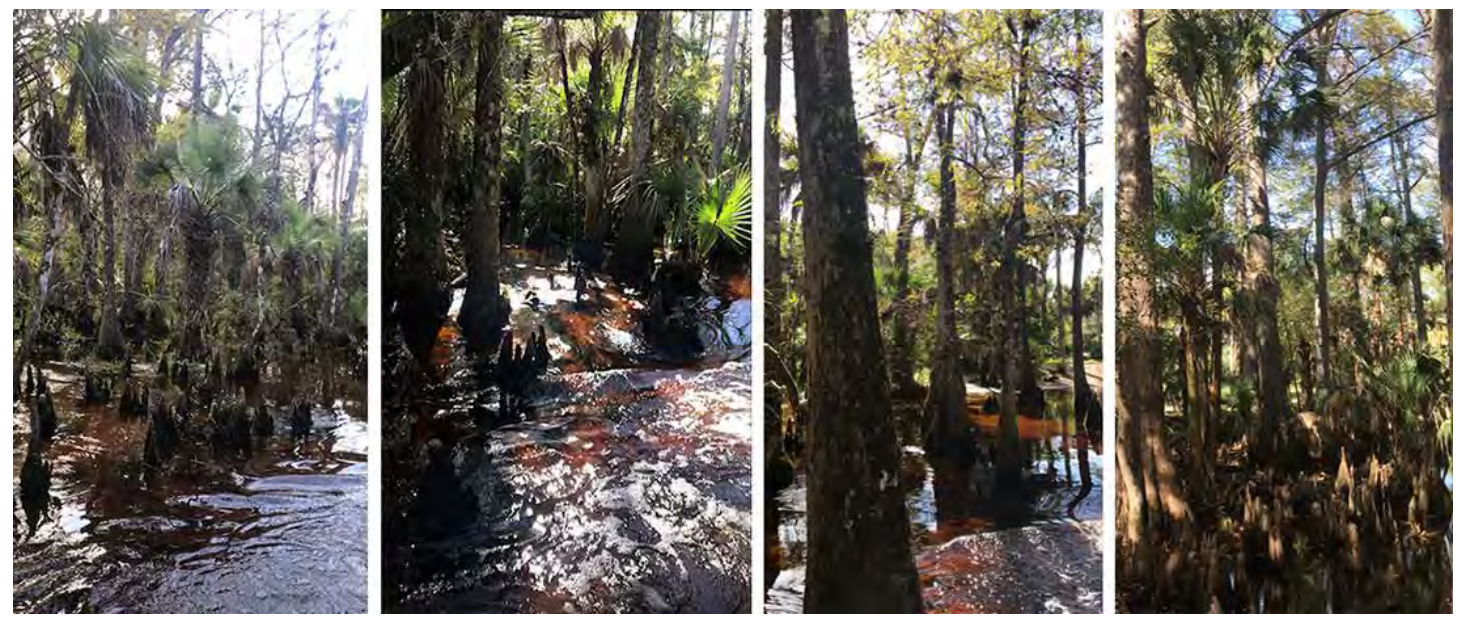
Mid-state Everglades: Recent rains made for a dramatic interaction with the southerly flow of water headed to Florida Bay!! Perhaps how the Everglades may have looked before the Army Corp of Engineers "fixed things".