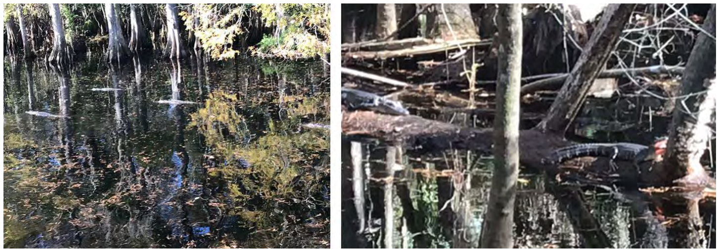
Gators, not logs!! Gators be chillin' in the lake where moments before they were sunning on the Gator Bridge. (l): Literally 25 gators had gathered on the bridge, basking in the direct sunshine caressing the lake. Likely took 5 minutes before all of them moved enough for us to pass! (r): Cold-blooded reptile temperature regulation in action. Yes, alligators "pant" as part of their cooling protocols!

Alligators are one of the most popular animals for guests to see at Babcock Ranch. They are an important part of Florida's ecosystem and while they were once on the brink of extinction due to loss of habitat, conservation efforts have helped preserve their population.