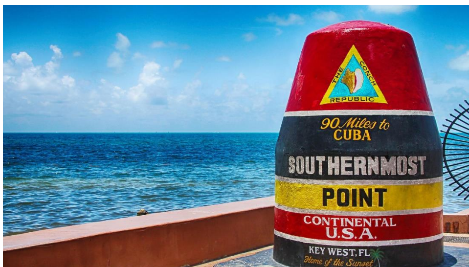
Southernmost Point Buoy