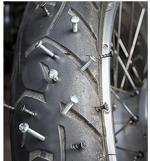
Don't Let This Ruin Your Ride

See our Mystery Hyperlink for further information on this topic.