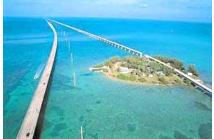
Seven Mile Bridge

blackened Mahi ! After lunch, with your belly stuffed, you'll continue onto Key Largo and eventually rejoin Hwy 1. You'll suffer with the Key Largo and Islamorada traffic for a few miles, then eventually make your way to Marathon and the Middle Keys. Here the traffic thins out, the sea air cools your ride and you can relax all the way to Key West. Don't forget to stop at the little parking area just on the north side of Seven Mile Bridge , on the right side of the road, to get the obligatory bridge picture!