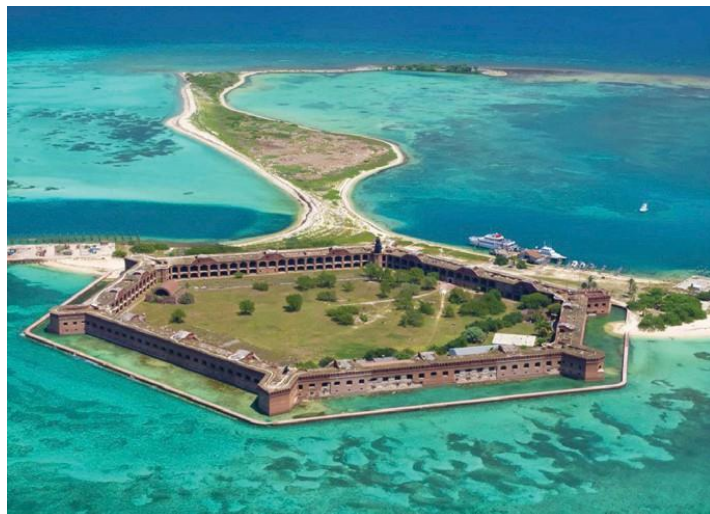
Fort Jefferson/Dry Tortugas National Park