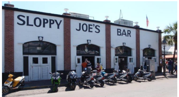
Sloppy Joe's Bar

There's much more to Key West than just hanging out at Captain Tony's or Sloppy Joe's (although it was good enough for Ernest Hemingway ). There are museums, tours, fishing charters, scuba diving, snorkeling trips, sunset cruises, and the list goes on. Or, you can just go lay on the beach.