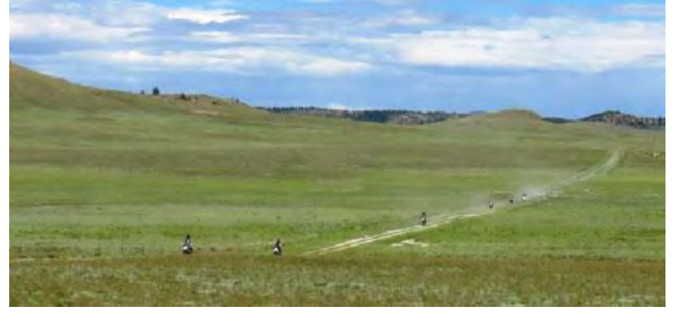
We took a long scenic route back to camp.

Once again we relaxed for a while around camp, enjoying beers and other adult beverages until another delicious dinner was served. The evening proceeded much the same as the day before, along with a beautiful night with a clear view of the stars.