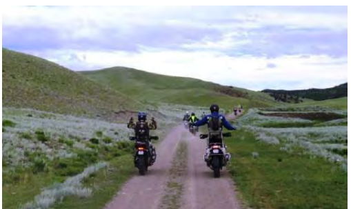
Trev and a trainee showed off by riding hands free while standing for a short distance.