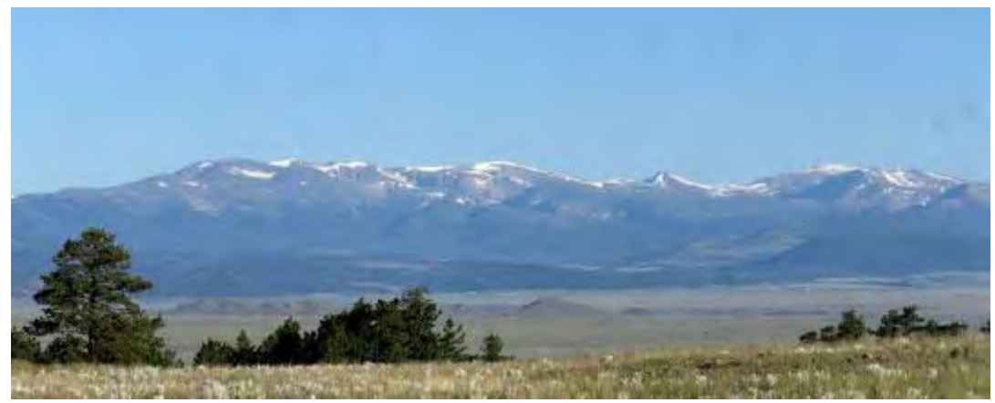
From the hilltop at the camp, we enjoyed this gorgeous view of the mountain range to the west.