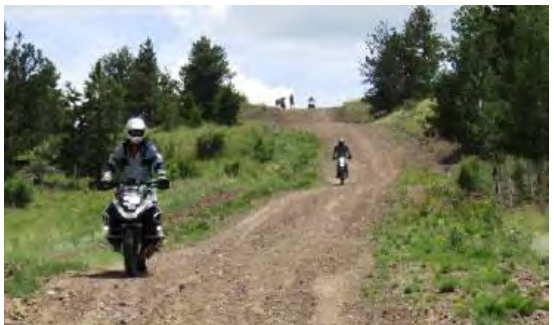
Other trainees coming down the same steep hills, although they don't appear to be that steep in my photos.

After satisfactorily completing that exercise, we returned to the particularly steep and rocky hill to learn how to perform a proper turnaround after stalling or stopping when heading up a steep slope, although we were not asked to perform this exercise.