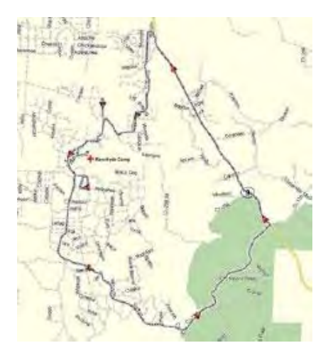
Our track log for today's exercises and our lengthy ride out to CO-9 after our training session.

hill and the tight turns in each loop of the serpentine trail that required careful throttle and clutch control as well as weight shifting to perform the turns. Thankfully, the trail was just dry dirt and not muddy! After practicing several variations of the exercises on that course and the small hills for