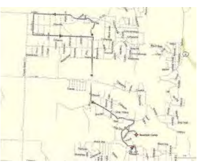
Map showing our track for this day's training sessions

Saturday's training session was more intense than the preliminary session was on Friday. We initially headed south to the same training area as Friday and repeated the balance and other exercises for nearly three hours. At 12:30 we returned to camp for lunch. After lunch we rode north to the second training area consisting of a short section where the instructors set up traffic cones for us to practice tight circles and figure-eight loops.