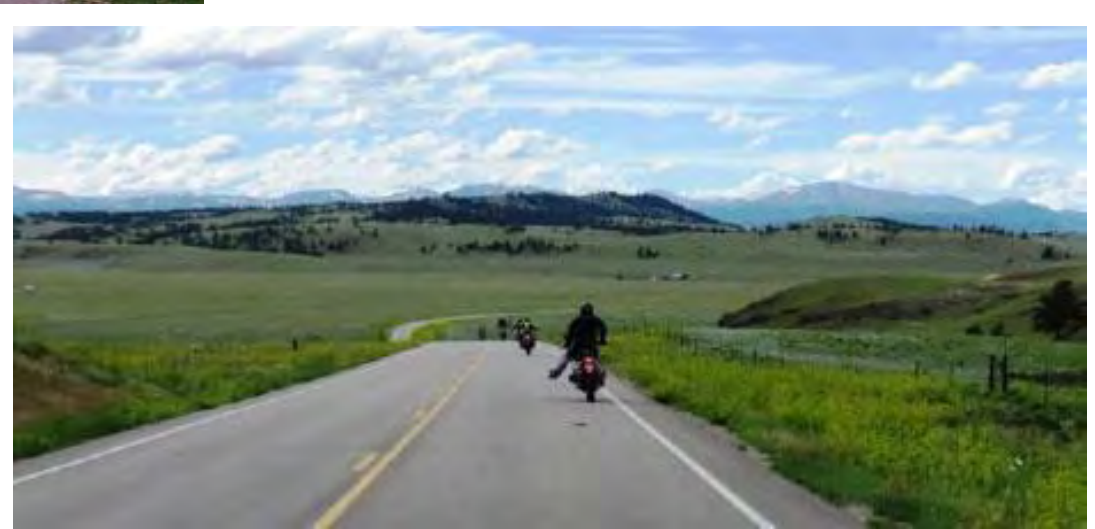
As a final photo from this excursion, this next one shows the view north along CO-9. The structures visible near the highway are close to the entrance to Buffalo Drive. We couldn't have asked for better weather all weekend!

We arrived back at camp by 5:30 PM in time for another delicious dinner and conversation. After dinner, I hooked up my laptop computer to the wide-screen TV and showed photos from our three days of training. This article contains only a small selection of my nearly 200 photos.