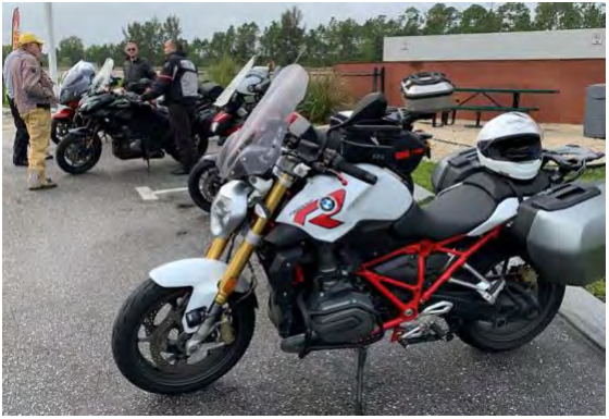
Dreary day but good ridin' and eatin' at Cowpoke's

Carl's report on the Central ride follows below. And 6 Southies made the ride as well! JR, a new face, started out with 3 usual suspects from the 7-11. Picked up Rick waiting for us at the Port Mayaca Locks, and added Larry at CrossRoads. Upon arrival, we spread out among the Central crowd and kept Carl hopping with the raffle ticket sales!