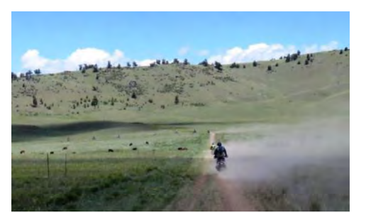
As we were leaving the first training area, the wind was blowing our dust trails towards the south.

At 9:40 AM we lined up at the staging point along the driveway. Another beautiful day to ride motorcycles in central Colorado!