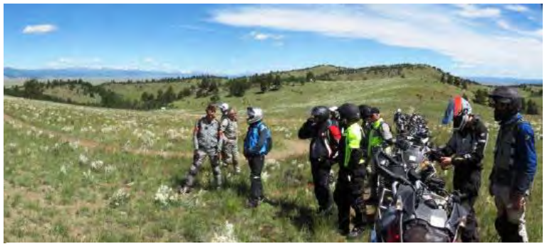
In this panoramic photo, a portion of the lengthy serpentine course can be seen behind the other riders.

Following the warm-up session, we returned to camp since our next lesson involved riding a tight serpentine course, which is located directly east of the camp on RawHyde's property and is fenced in to prevent livestock from "messing up" the course. Additionally, several small dirt piles were placed in a line to allow us to practice riding up hills and stopping briefly before continuing down the other side.