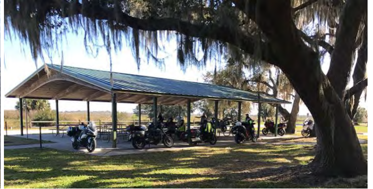
Great Central Ride park destination – Coleman Landing at Shady Oaks Rec Area

A week later, the South Lunch Ride headed way south! With decent weather in our favor, we made our way back to Everglades City to enjoy the southwest region of Florida. Our last attempt to venture there was thwarted by hurricane #28 or so!! The ride down and back was pleasant and uneventful. We anticipated more diners at the restaurant but ended up with nearly everyone at the Everglades National Park . Once again, plenty of shaded tables, good gab and wonderful scenery!!