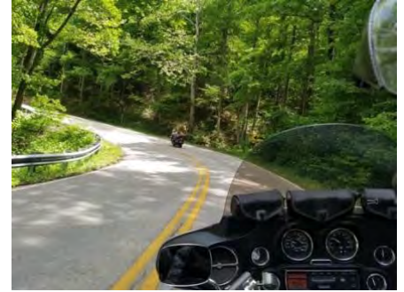
Lots of riding on twisting, turning roads in the Mountain State

Since this is a Sport Touring Club meet, located in the Mountain State, and held in the middle of hundreds of miles to twisting, turning roads, the obvious answer is that first and foremost there is LOTS of riding to do! When you get there and get registered you will be able to download into your GPS several suggested self-guided routes that will highlight many of the great roads in West Virginia and western Virginia . The routes will vary in length and difficulty as we try to provide routes for everyone's taste and desire. We will even have some dual sport routes (this is a great area for that!) provided for those bringing bikes suitable for that activity. For those new to the MSTTA know this, we do not do big, large-group rides. You won't see a hundred bikes all heading out at once in a parade. I know that is common at many "biker" rallies, but it's not our style. Instead, you will see several small groups of 2-5 bikes head out individually to ride one of the several provided routes, or to ride their own route!