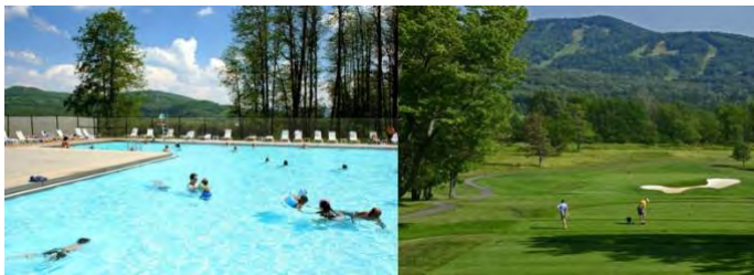
Canaan Valley Resort offers lots to do beyond riding.

Beyond the riding, many people treat this as their yearly vacation, and we've got you covered there too. Since this is a resort, there is lots to do there and in the surrounding area. Swimming, hiking, golf, mountain biking, horseback riding, skeet shooting, fishing, rafting, or just relaxing are all available either onsite or close by. There are also several other parks and scenic locations worth seeing in the area ( Seneca Rocks and Blackwater Falls are just two). Many people spend a day or two riding to a STAR and then take a day off when they get there, especially ones coming from hundreds of miles away.