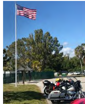
South Ride lunch at Everglades National Park