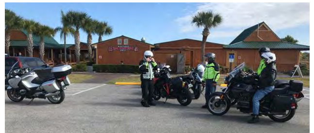
Even with the cold weather, we had a good turnout at the Westgate Smokehouse Grill.

Considering the Covid19 threat and the cold weather, we had a really good turnout for the Central MSTA Lunch Ride to River Ranch Acres . Saturday morning was cold, at least by Florida standards – 46° F when four of us headed out for our 94-mile ride to the Westgate Smokehouse Grill . I-4 was only a bad dream at that hour instead of a nightmare. Traffic was relatively light. It was a pleasant ride down US 27 to SR 60.