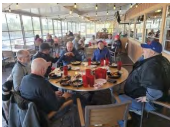
14 riders enjoying delicious food and great camaraderie

We arrived at the Westgate Smokehouse Grill at 11:05 and met two other riders who had seen our ride on the website. At 11:30 we were all seated and ready to eat. Fourteen MSTA riders were at the restaurant and eight other riders went to the park for their picnic. The food was delicious and the camaraderie great. It is always fun to get together with other MSTA riders.