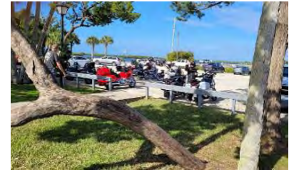
New Year's Lunch Ride in Crystal River

January's New Year's Day ride took advantage of the clear, bright, sunny, a bit breezy and unseasonably warm weather. In short, a near perfect day for a ride. Five members gathered at Carl's house for a 9AM departure. Ilse joined them from Ft Lauderdale. She wanted to explore the back roads. The route took them through rural Florida on mostly two-lane backroads, easy riding and nice scenery.