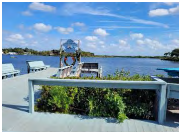
Everyone enjoyed lunch at beautiful Old Port Cove.

They arrived at Pecks Old Port Cove in Crystal River at 11:40 and met two MSTA members from Ohio. Everyone ate outside on the deck or at the Tiki Bar. Four other members headed for the park just up the road. In total there were 15 folks enjoying the outing in the beautiful Old Port Cove setting. The food was delicious as always. The catches of the day were red snapper and grouper. The camaraderie was great, a pleasant lunch in a relaxing setting.