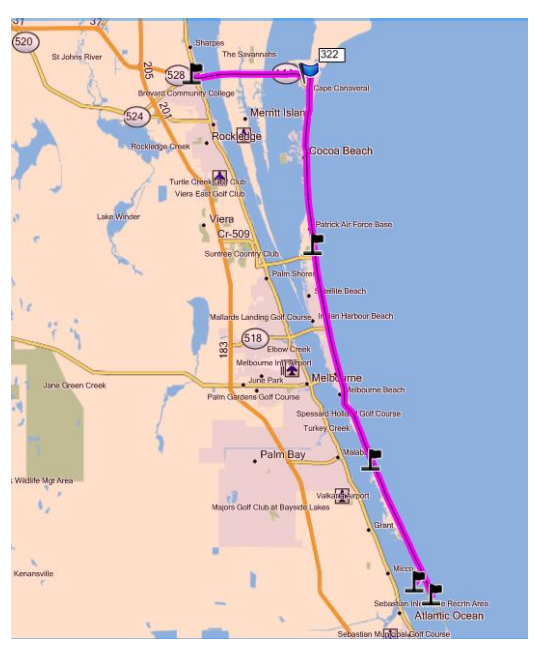
Highlighted is A1A from Sebastian Inlet to Port Canaveral including Long Point and De Leon Landing Historical Site Park, PAFB then west on 528 to Hwy

It's a popular destination with camp sites right at the water's edge. Fishing, hiking, kayaking, canoeing and motor boating are popular here. A wooden foot bridge connects to a small island with hiking trails. The park has several pavilions, grills and room in between for volleyball or other activities. There's a charge for camping but not for casual access to the park. It's fun to just ride in, circle around the