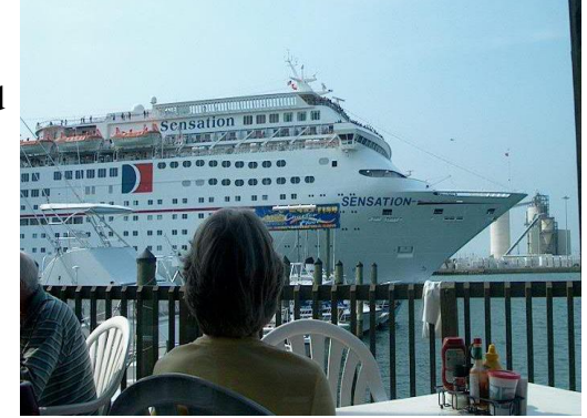
Table with a view at Port Canaveral (@Google Earth).

Port Canaveral is at the northern end of this section of A1A. Several cruise lines including Disney, Carnival, Royal Caribbean and Norwegian use the port so when they're in, you can marvel at the sight