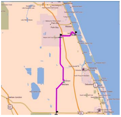
Highlighted are Rte 512 between Rte 60 and

Another access from the south and west is Rte 512 from SR 60 between Yeehaw Junction and Vero. Follow it to Fellsmere and then take Rte 507 from Fellsmere to as far north as Melbourne.