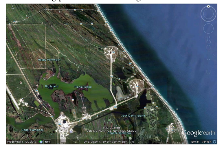
KSC launch pads 39A and B (right) and VAB (bottom left).

Northern Hwy 3 crosses Haulover Canal about halfway up. It was dug in the late 1800's to facilitate