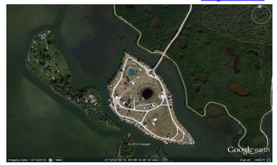
Long Point Park along the Indian River. Hiking trails are on the island to the left of the park.

About a mile north of the inlet on the river side is Long Point Park .