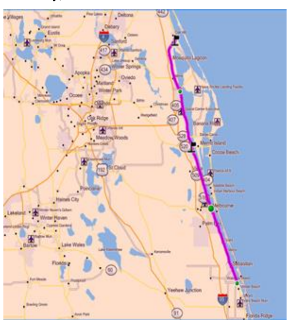
US 1 is highlighted from Wabasso in IR County to Oak Hill in Volusia and runs very close to the west bank of the Indian River in most areas.

These are rural 2-lanes at least until 507 crosses 514 (Malabar Rd). Then it's 4lane and stoplights up into Melbourne where it joins US