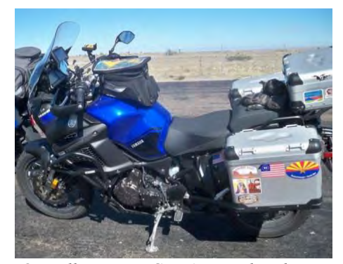
Overall, it was a GREAT trip, but then to me all motorcycle trips are great.

All was good on the morning of Friday the 8th as I had less than 450 miles to get home. Chances were that I'd have no rain, but I dressed for it anyway. Although no rain came my way, the wind gusts did, and one tended to get blown around somewhat on a bike which can wear one out. However, I was on the home stretch and could see the light at the end of the tunnel, so Mother Nature could bring whatever she so desired. I arrived home at exactly 1 pm with 435 miles for the day.