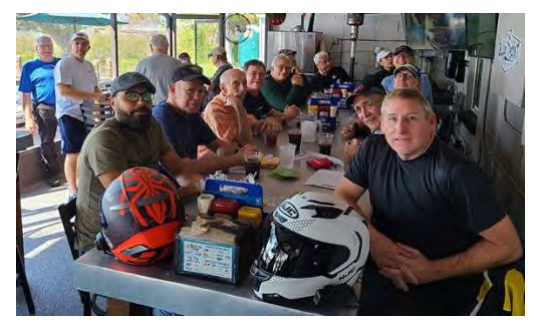
Perfect lunch ride to the Twisted Prop in Winter Haven. Pleasant weather, lots of gab and a great way to close out 2022

Now then... To my great surprise, "twisted prop" has nothing to do with airplanes (I'm ex-Air Force, see). The restaurant sits along side Lake May in south, central Winter Haven. There must be twenty-five or thirty