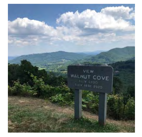
BRP lookout as beautiful as in all the promo materials

Saturday turned into the day you wished you'd have rented that U-haul after all. Cough, hack, cough, ride...The first 20 miles south from Dillsboro through Clayton, GA was the only "fun" for the rest of the day. Tropical Storm Claudette made her presence known with a good thorough soaking somewhere south of Abbeville. And those days of 50° mornings were replaced with 90° days! Dealing with below-average road signage and avoiding the interstate mess in South Carolina made for a long day to get to