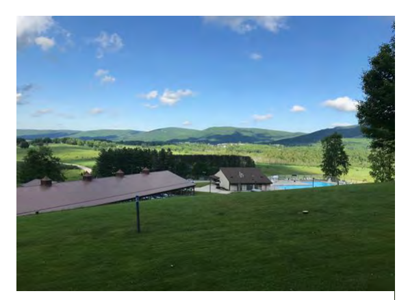
"Smoky" hills view right outside your window at the Canaan Valley Resort

After 24 months without a national rally, I was ready! Well, sort of. More about that later. For now, know this -"we" all had a wonderful time!! 275 riders enjoyed the resort, the roads and the comraderie! The planning involved behind the 3,000+ miles of routes and GPS coordination was well done and enjoyed by all who ventured out. The arrangements with the Canaan Valley Resort were terrific. Despite being understaffed, very few glitches actually had any impact.