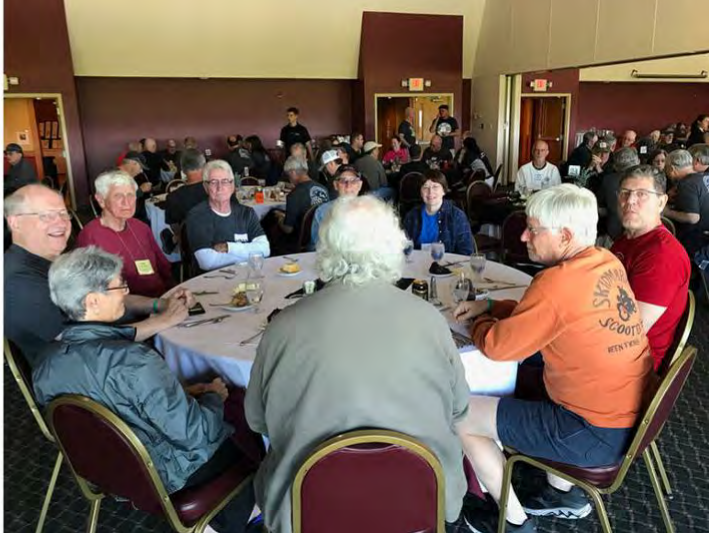
The Florida contingent took up two tables at the STAR banquet.